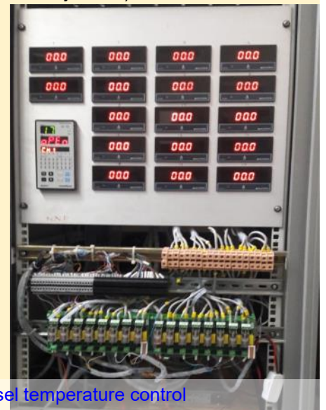
(L) The SMARTEX-C device (R) The data logger and controller for vessel temperature control