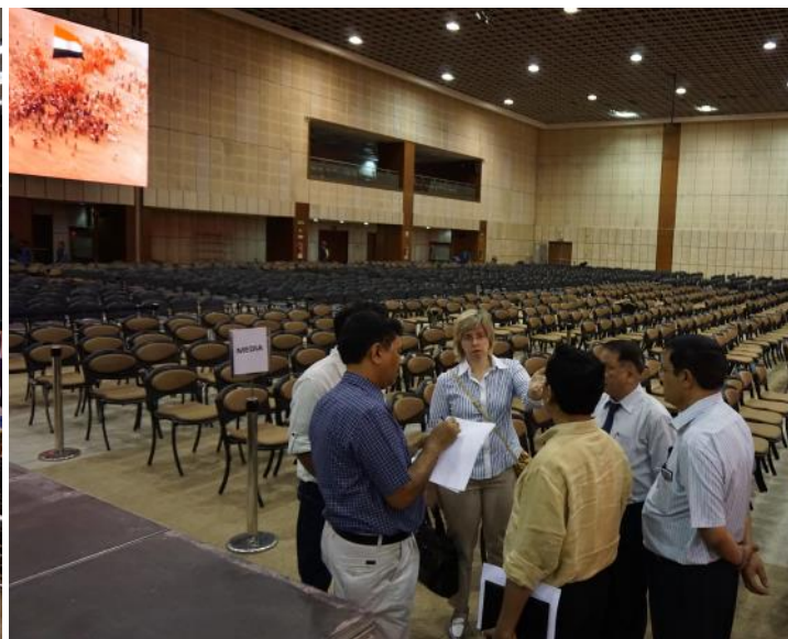
The IAEA and IPR team at the Mahatma Mandir, discussing various aspects of organization of the FEC 2018.