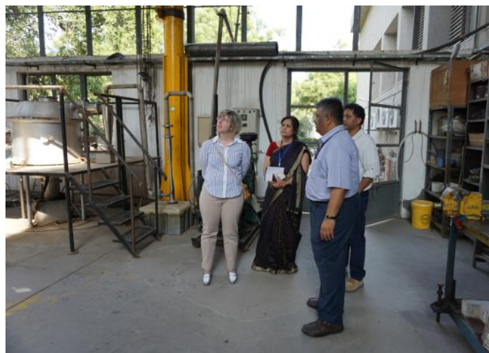
The IAEA team visiting various labs in IPR extension labs/ FCIPT (L) Fusion Fuel Cycle lab (R) Plasma pyrolysis lab