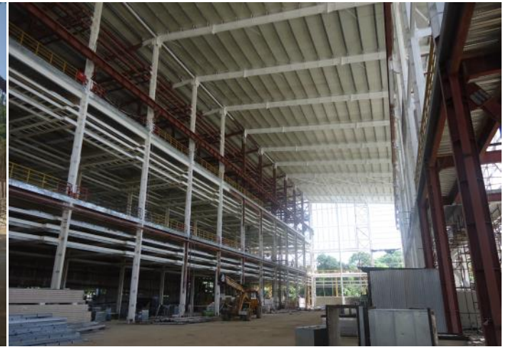
(L) The Neutronics building under construction (R) Inside the Laboratory Building