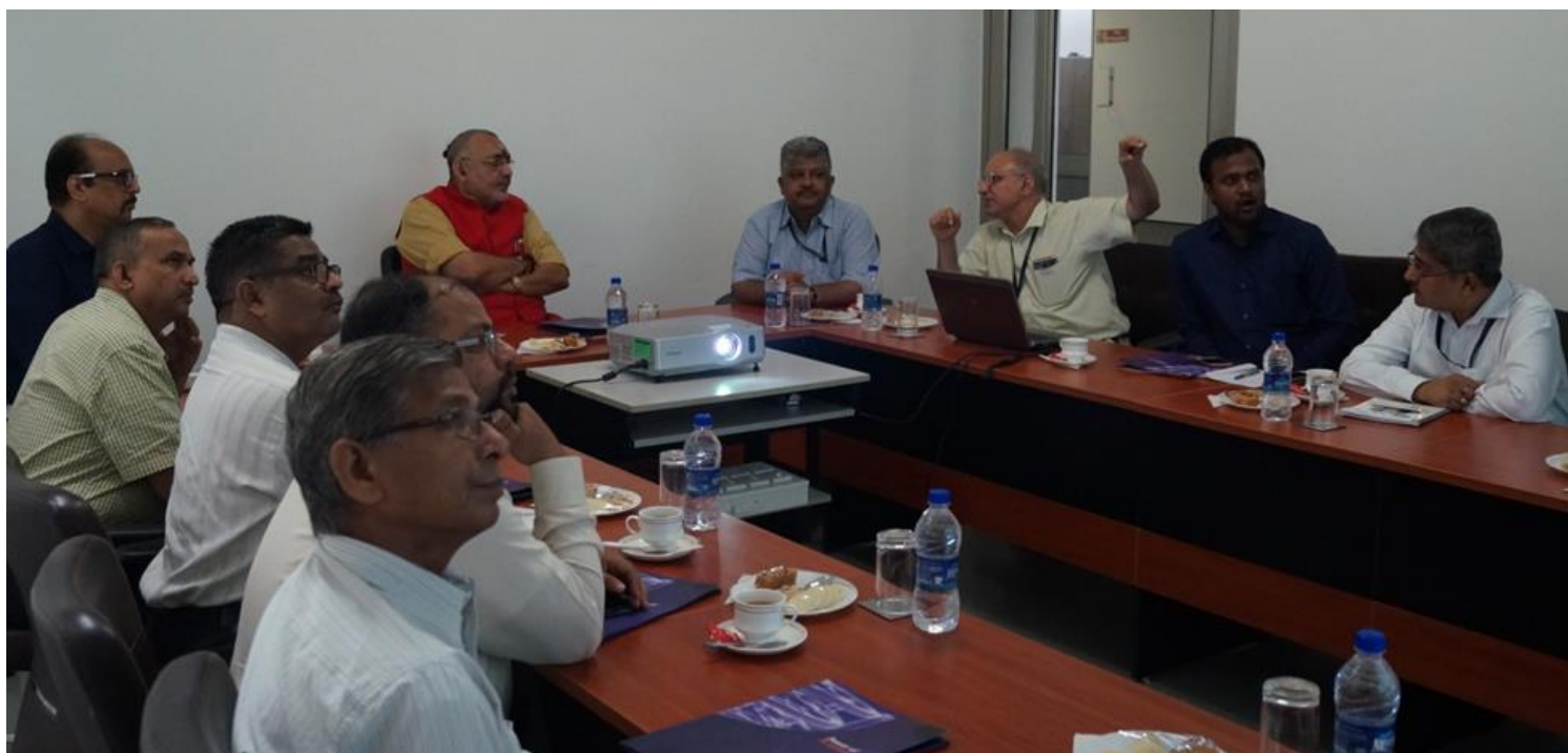
L-R top : The MoS being received at FCIPT; . Bottom : The MoS and his team being briefed about the activities of FCIPT.