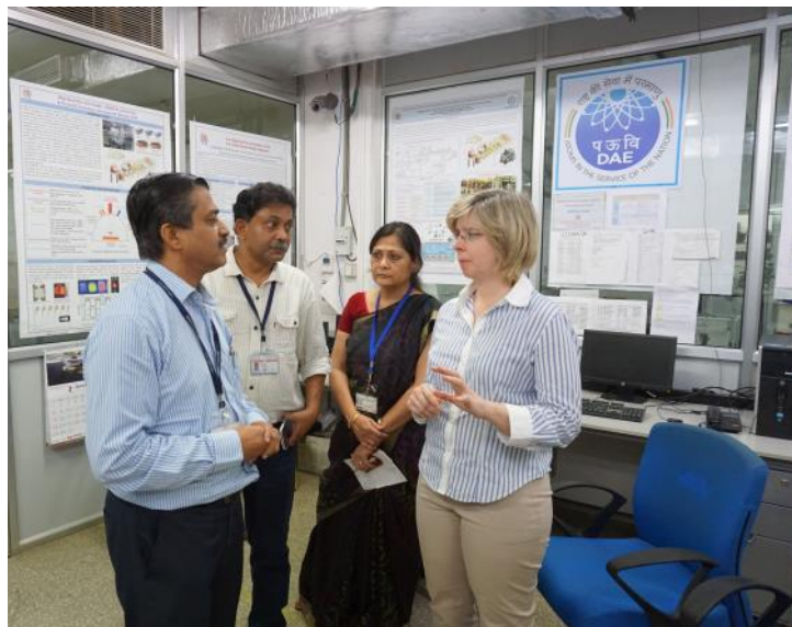
The IAEA team visiting various labs in IPR/IPR extension labs (L) LVDP lab (R) High heat flux facility