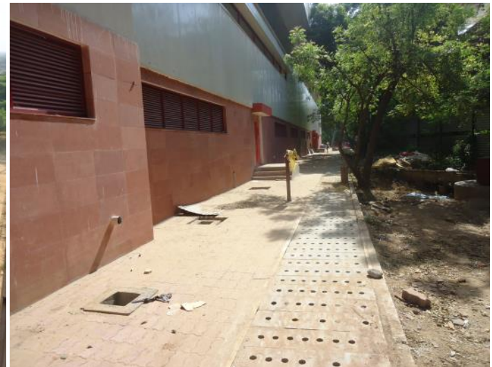
(L) The completed roofing of the Laboratory Building (R) Development work around the Laboratory building