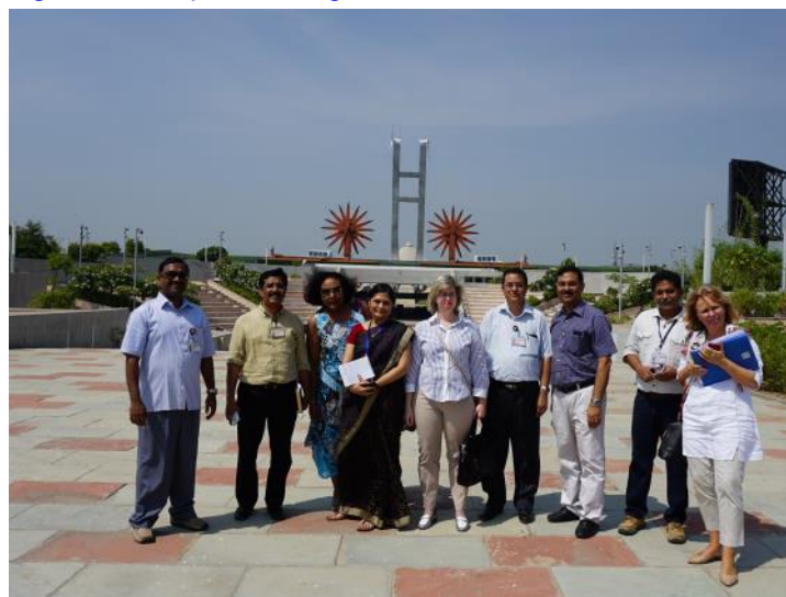
The IAEA and IPR team at the Mahatma Mandir.