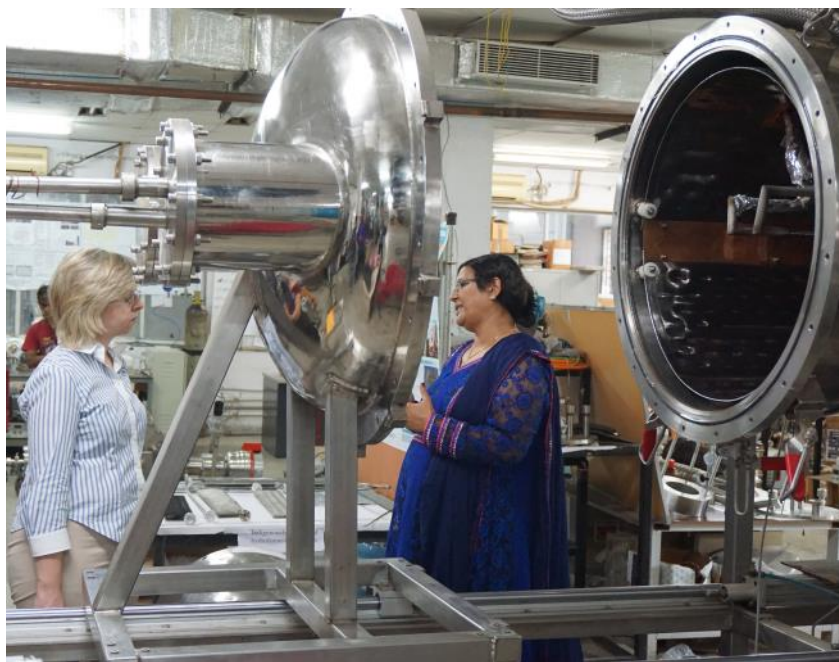
The IAEA team visiting various labs in IPR extension labs/ FCIPT (L) Robotics lab (R) Cryopump development lab