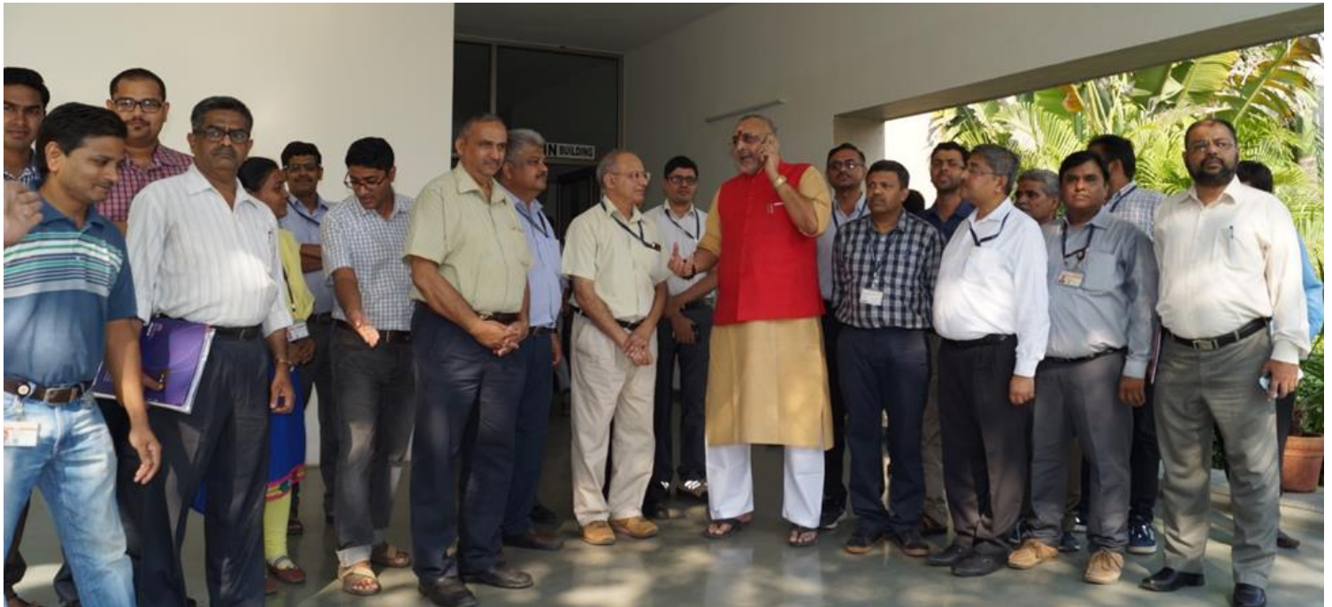
L-R top : The MoS being shown plasma treated wool and jute; Plasma nitriding process. Bottom : The MoS with the FCIPT staff.