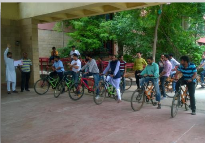
(L) Health checkup organized for IPR staff during the independence day (R ) Slow-cycle race for IPR staff