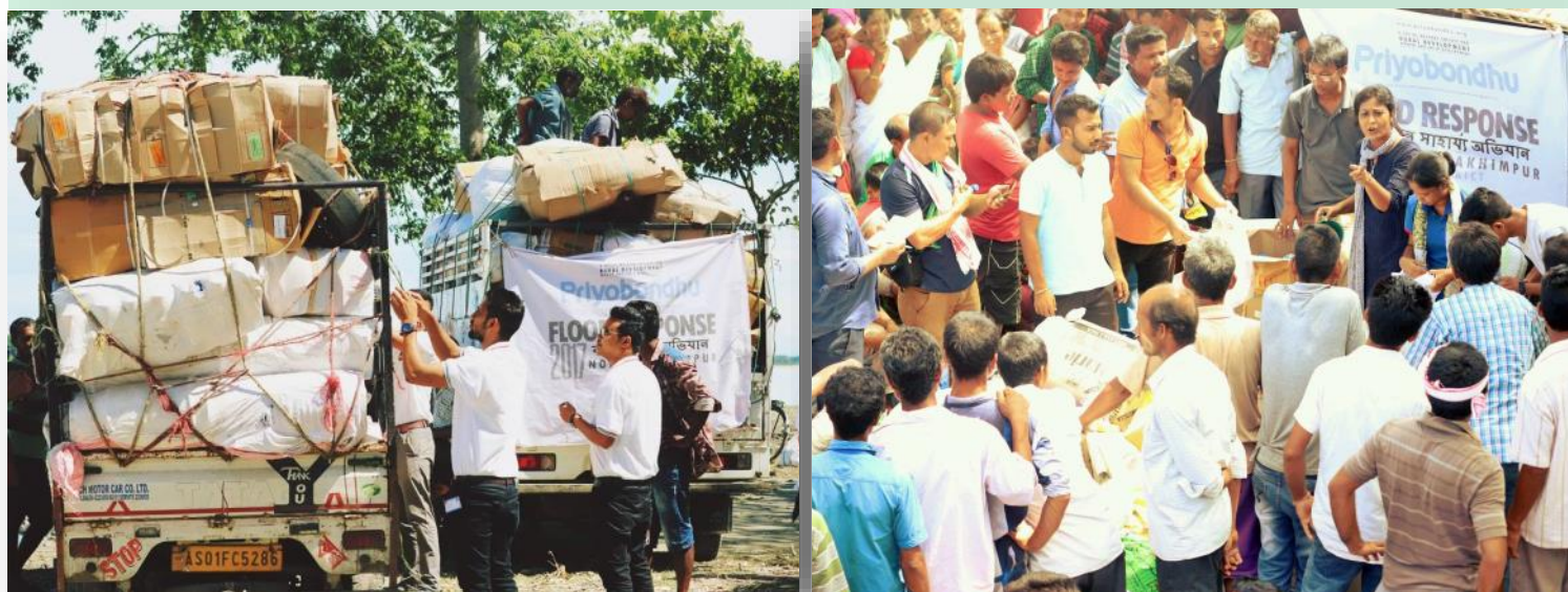
(L) Dispatch of the items for the Assam flood relief from CPP-IPR. (R ) Distribution of the items to the flood affected people.

Assam has experienced furious floods during the current monsoon season. Over hundred people have died and tens of thousands of people rendered homeless. On 22 July, with the help of a Guwahati-based non-governmental organization, PRI-YOBONDHU, CPP-IPR tried to reach out to the flood victims of Assam with relief materials. Regular/temporary staff members of CPP-IPR voluntarily contributed to the cause in the form of cash and or in kind.