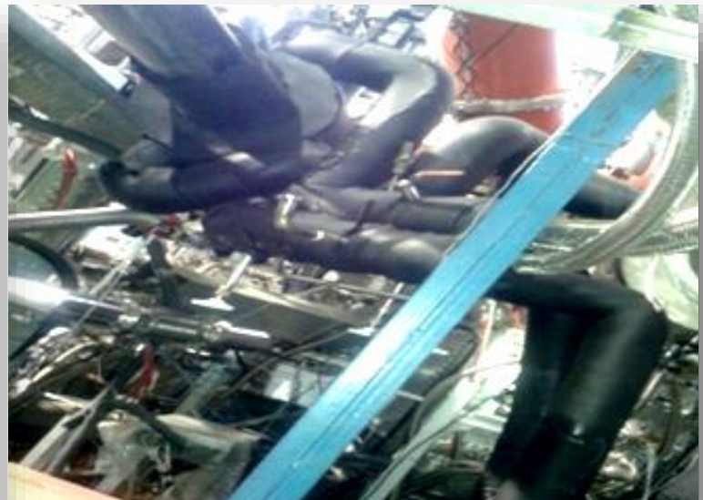
Flexible Elastomer Foam Nitrile Insulation on SC duct piping and surfaces at 80 K Temp