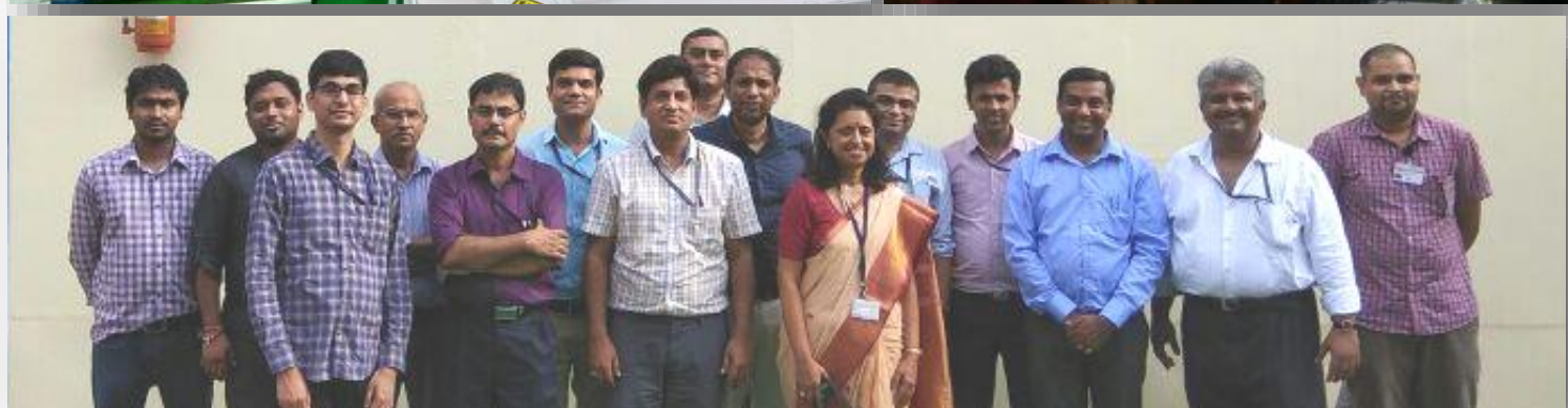
Images from IPR's participation in the Science Exhibition at Kolkata