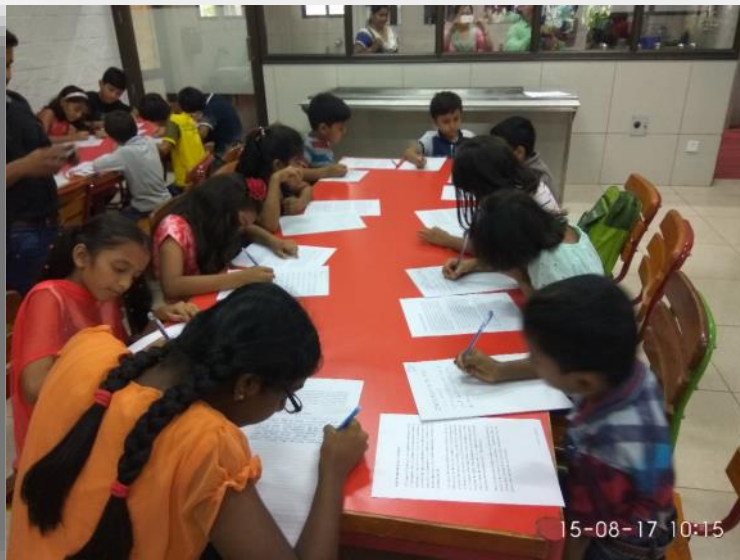
Handwriting competition in progress for the children of IPR staff