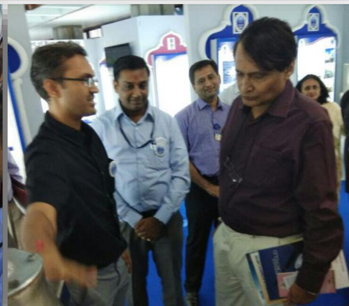
(L) Dr. Sanjay Jaiswal and Shri Giriraj Singh (MP and MoS - MSME) (R) Shri Suresh Prabhu (Minister of Railways)