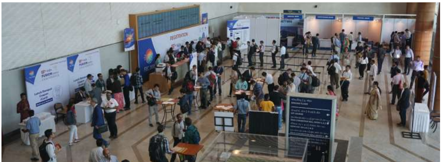
Conference registration in progress