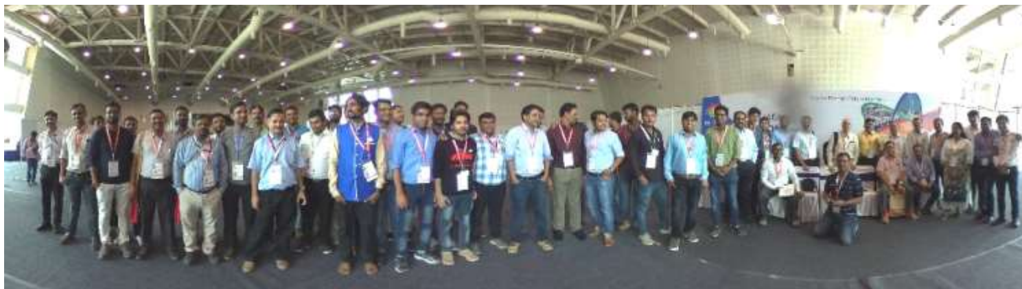
The Local Organizing Committee of FEC