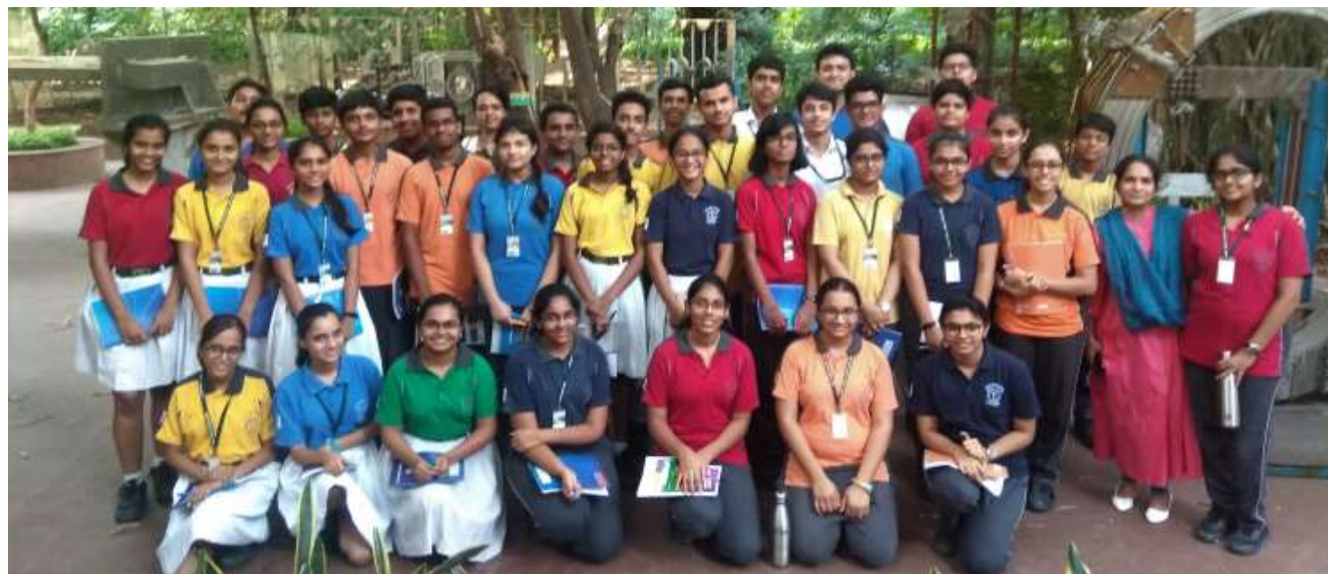
Students from DPS, Bopal Ahmedabad during their visit to IPR