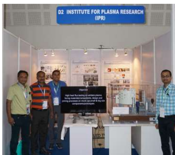
Exhibition stalls from IPR, FCIPT, CPP-IPR and ITER-India at the FEC 2018