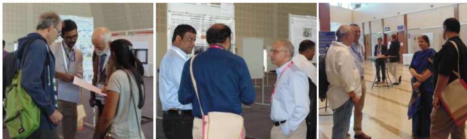
Scientific & casual discussions !