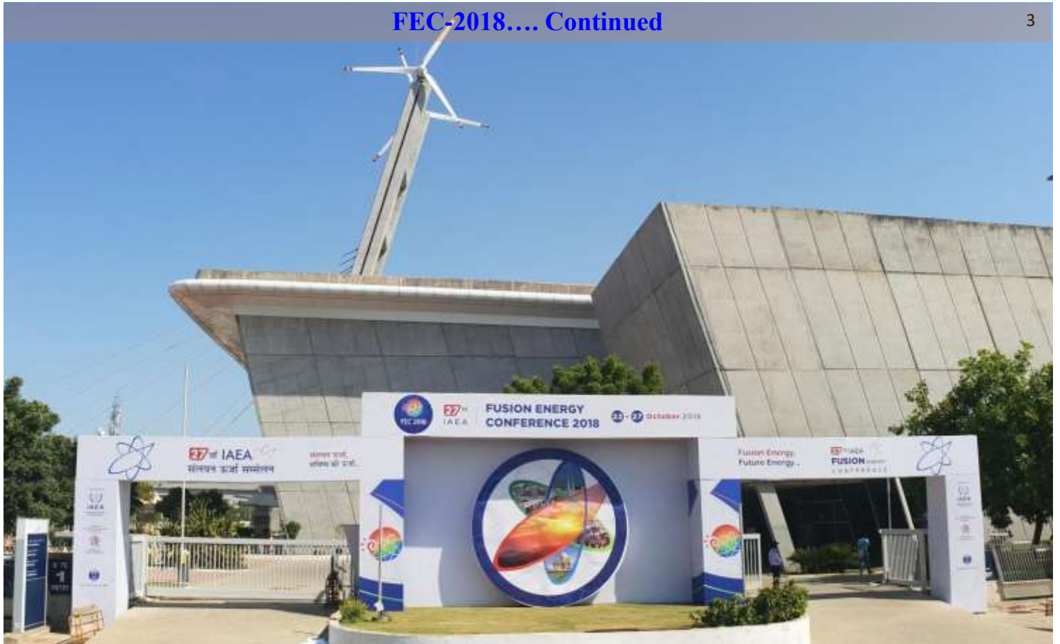
Entrance to the conference venue