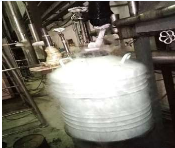
(L) Re-routed insulated line to 15 L phase separator (R) LN 2 flow rate measurement in 50 L Dewar