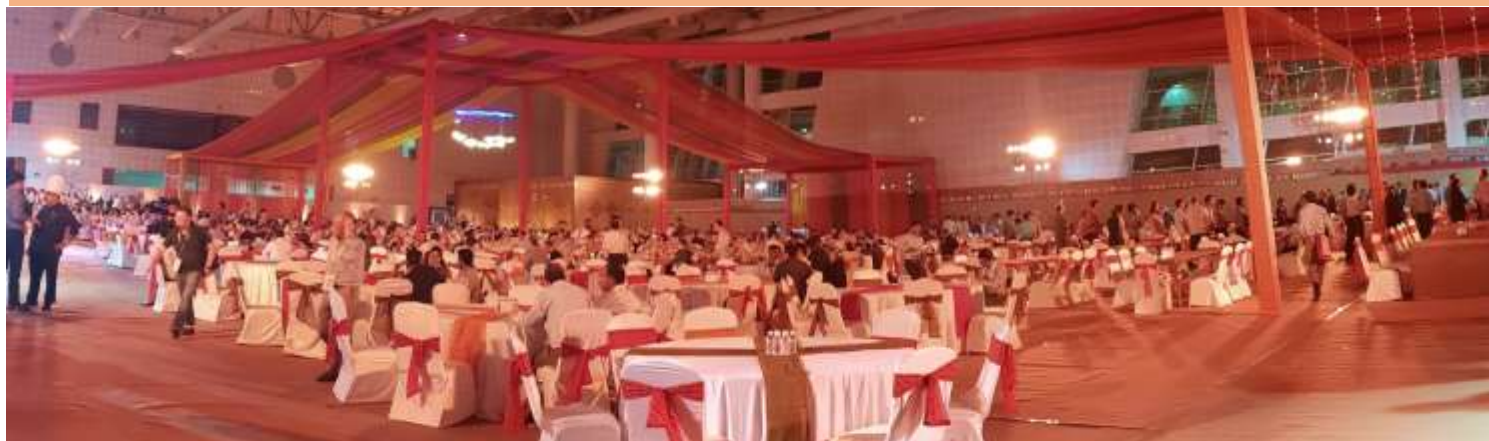
The welcome dinner arranged for the participants of FEC 2018 on 22nd October 2018