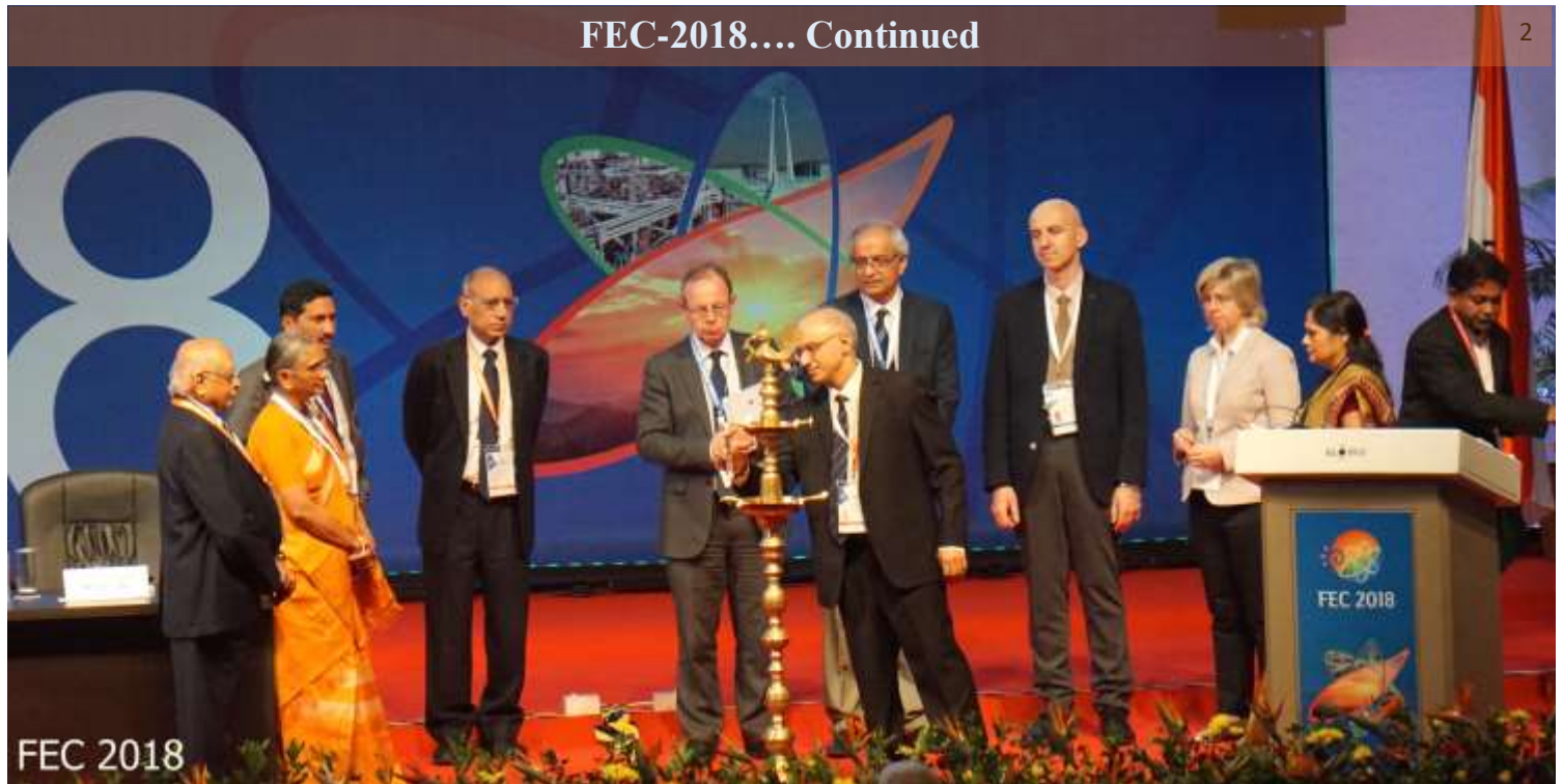
Lighting the traditional lamp during the inauguration of the conference