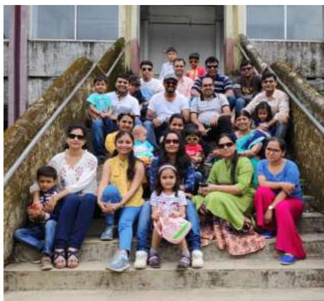
Images from the Staff Club organized picnic to Saputara