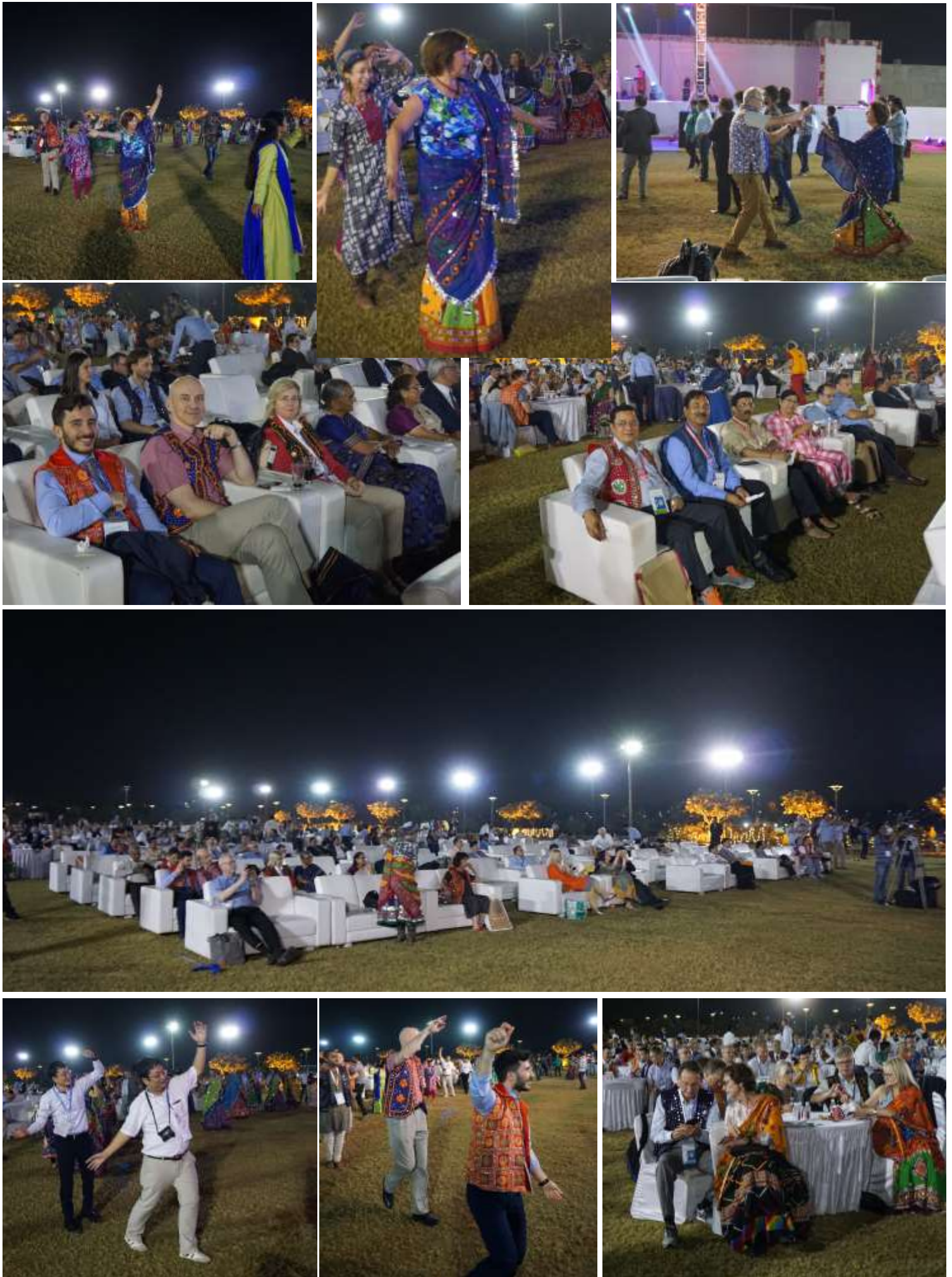
Images of the fun and dance during the Conference Banquet held at Sabarmati Riverfront