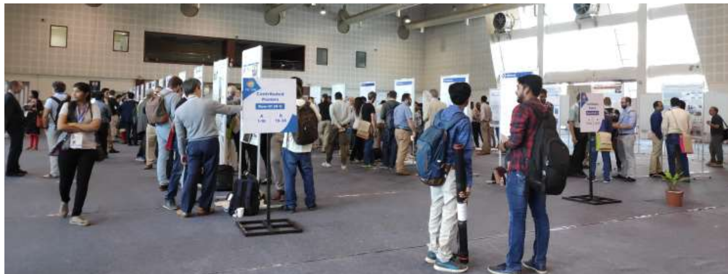
Poster session in progress