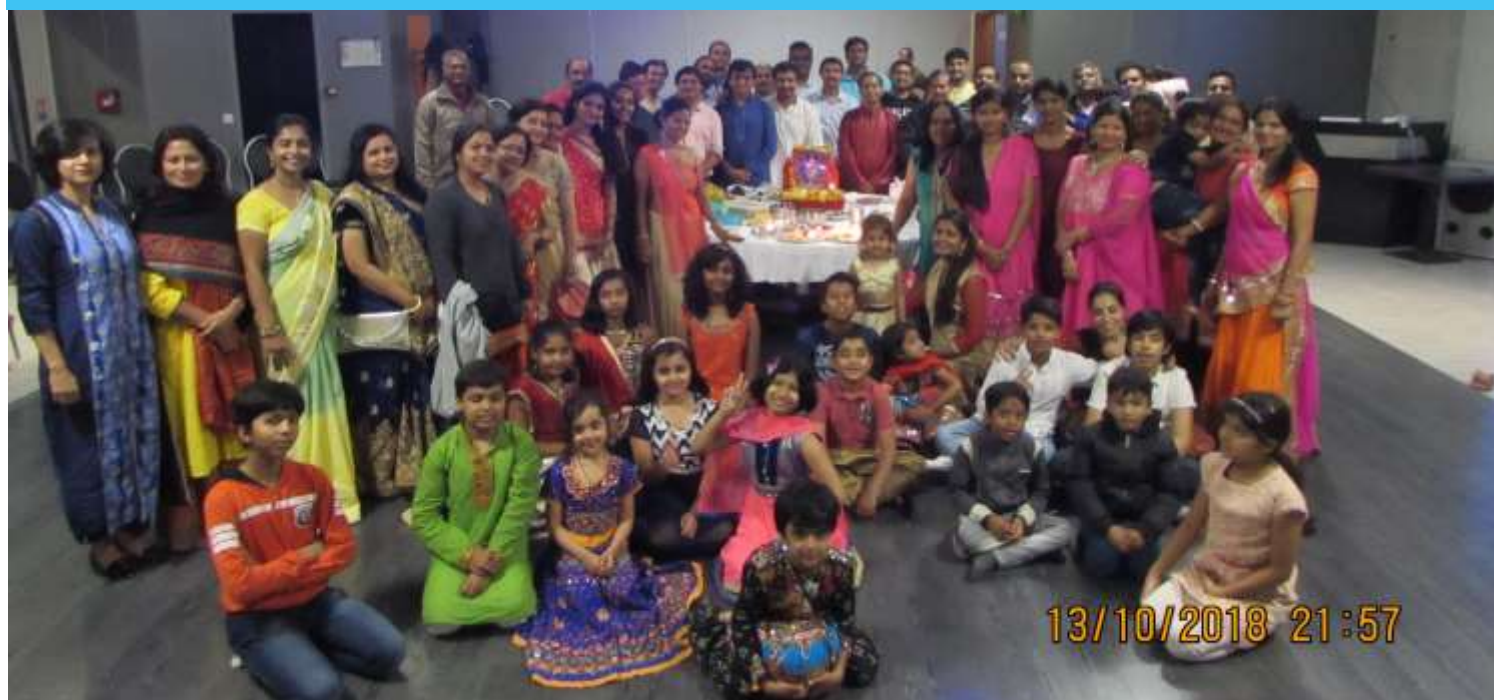
Navaratri was celebrated in Manosque on Oct 13, 2018. Around 105 persons including family members of IPR, BARC, TCS, and INOX working at ITER and some local Indians residing in and around Manosque attended this celebration.