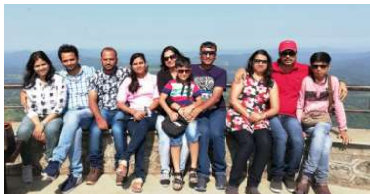
Images from the Staff Club organized picnic to Saputara