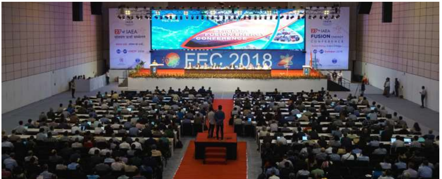
View of the podium and a section of the audience