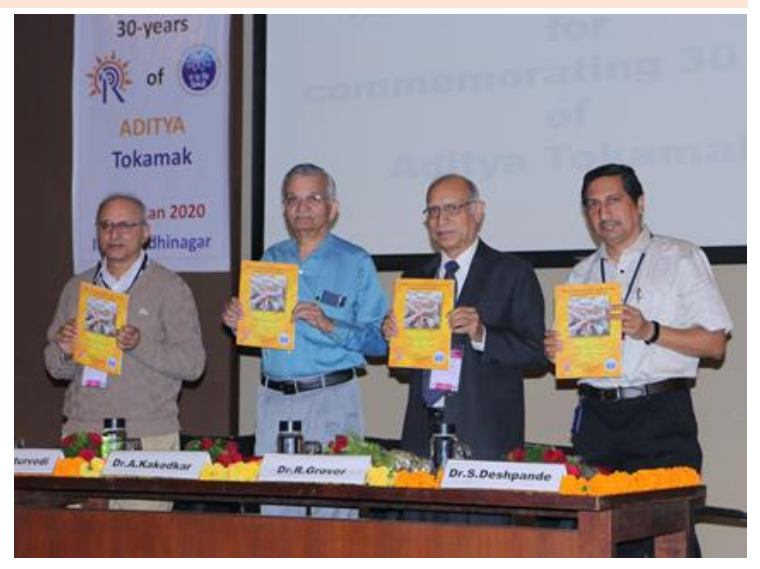
(L) Inauguration of NSC30AT2030 (R) Releasing of the Souvenir of NSC30AT2020