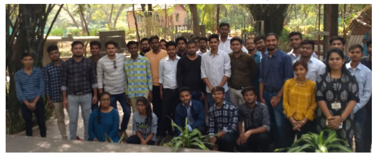
Students of the H&HB Kotak Institute of Science, Rajkot, during their visit to IPR