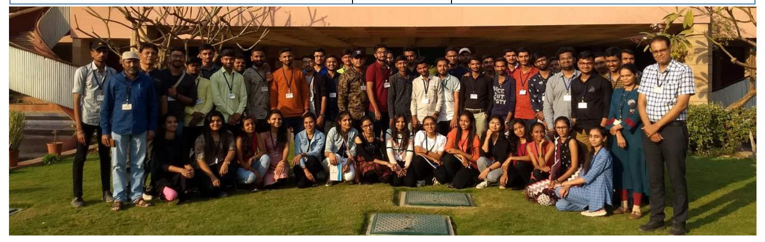
Students of the Govt. Engineering College, Banswara, Rajasthan, during their visit to IPR