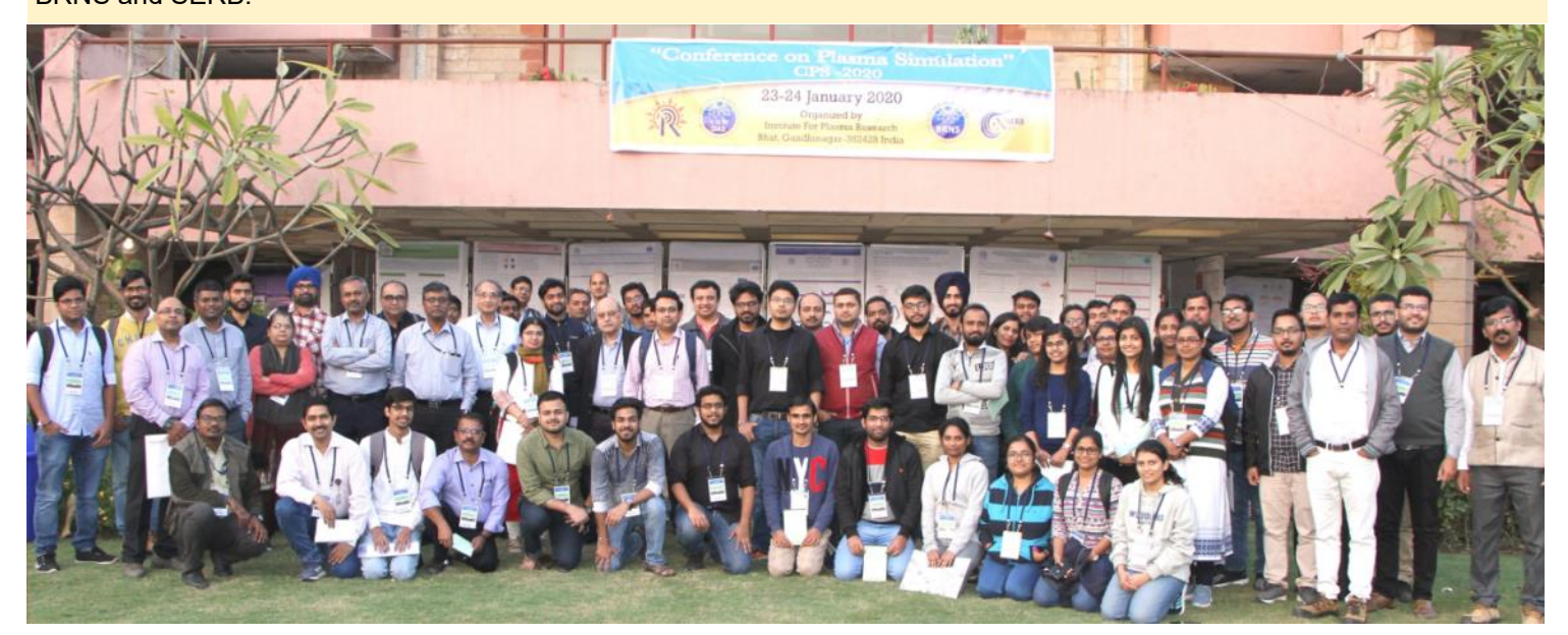
Participants of the Conference on Plasma Simulations held at IPR

A Conference on Plasma Simulations (CPS) was held at the Institute for Plasma Research during January 23-24, 2020. The conference was well attended and was rich in scientific content. There were 22 invited talks and 52 poster presentations during the 2-day event. The participants came from more than 23 different universities and research institutes across India and their research interests and contributions covered a wide range of plasma science topics such as magnetic and inertial fusion, space and astrophysical plasmas, plasma surface interactions, industrial applications of plasma, plasma based propulsion devices, plasma based particle accelerators etc. A host of simulation models and techniques such as gyro-kinetic and gyro-fluid models, MHD models, fluid and PIC simulations were discussed. This conference was supported by IPR, DAE-BRNS and SERB.