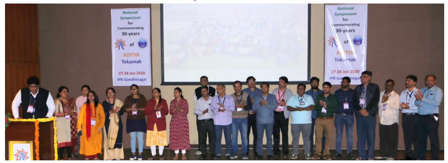
The LOC members of the conference