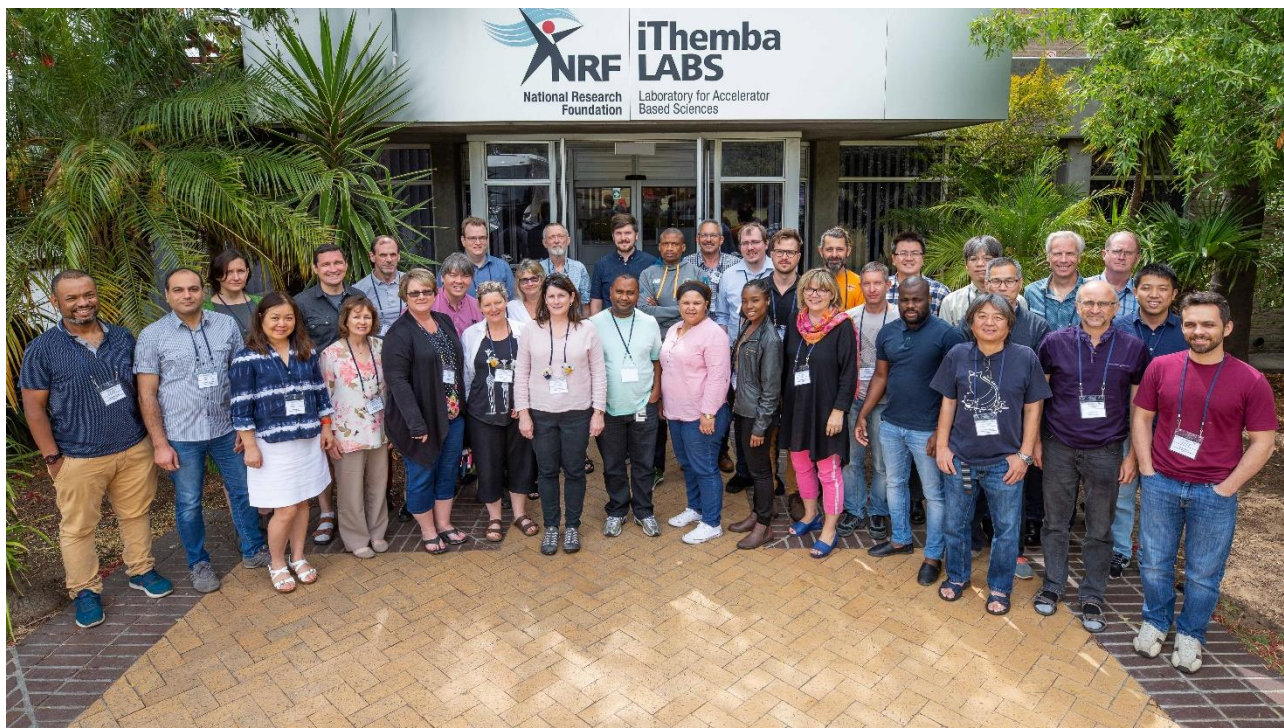
Figure 2: Example of a full-width figure showing the JACoW Team at their annual meeting in December 2018. This figure has a multi-line caption that has to be justified rather than centred.

The names of authors, their organizations/affiliations and postal addresses should be grouped by affiliation and listed in 12 pt upper- and lowercase letters. The name of the submitting or primary author should be first, followed by the coauthors, alphabetically by affiliation. Where authors have multiple affiliations, the secondary affiliation may be indicated with a superscript, as shown in the author listing of this paper. See ANNEX A for further examples.