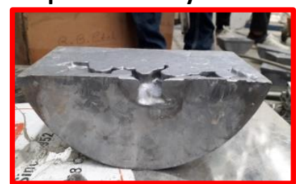
Pb-16 Li ingots produced at IPR

The lead lithium eutectic (Pb-16Li) alloy, enriched at 90% in <sup>6</sup>Li is a potential candidate as tritium breeder in the liquid metal breeding blanket system of future fusion reactors like ITER and DEMO. It is quite challenging to develop this alloy because the elements lead and lithium have a significant density difference, making it difficult to effectively mix them. This paper discusses the indigenous development of an Pb-16Li production system of capacity 75kg/batch. MHD stirring-based Pb-16Li production system has been in-house developed to cater to the need for Pb-16Li as a process fluid for various Pb-16Li R&D experiments at IPR. A total of ~ 750kg of Pb-16Li ingots have been produced and characterized to determine the eutectic composition and eutectic temperature. The analytical characterization techniques such as ICP-OES and DSC confirm the eutectic composition of Pb-16at%Li and eutectic temperature in the range of 235-238°C respectively. The solidification curve of the produced ingots also suggests a melting point of ~235 °C confirming the formation of the Pb-16Li. The homogeneity of the produced ingots was ascertained by SEM analysis which indicates the homogeneous microstructure of the produced alloy.