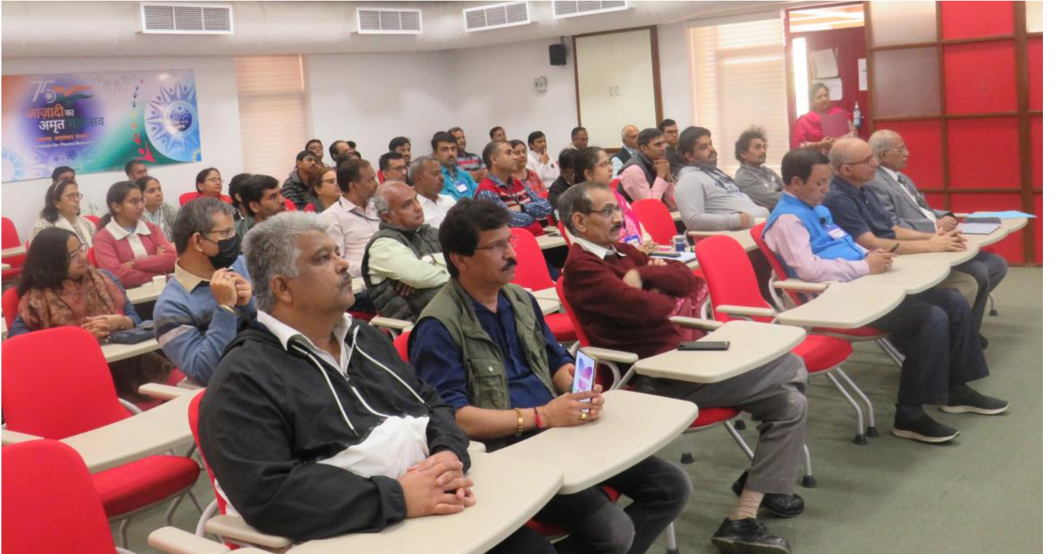
सेमिनार हॉल में उपस्थित श्रोतागण