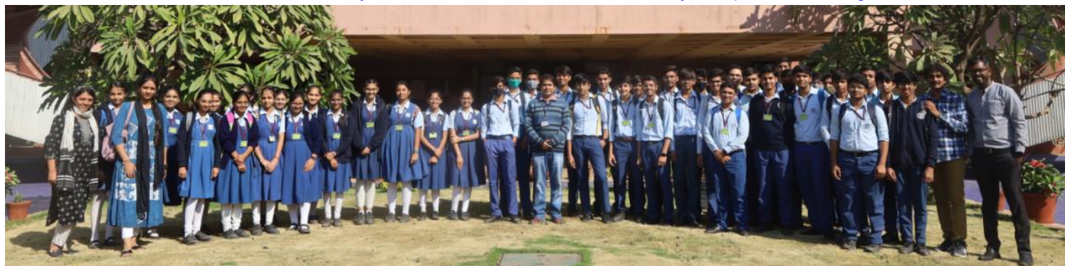
Students and teachers of Hiramani School, Ahmedabad during their visit to IPR