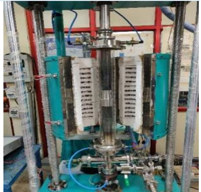
(L) EHCL system at IPR (R) Thermo-mechanical test facility for pebble beds measurement