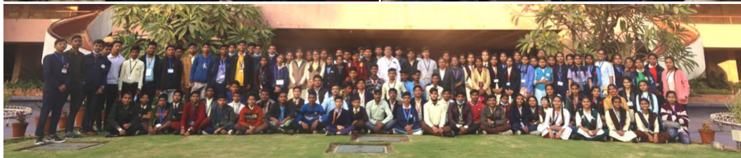
Students and teachers of the Madhya Pradesh Lok Shikshan Sanchanalay, Bhopal, M.P. during their visit to IPR