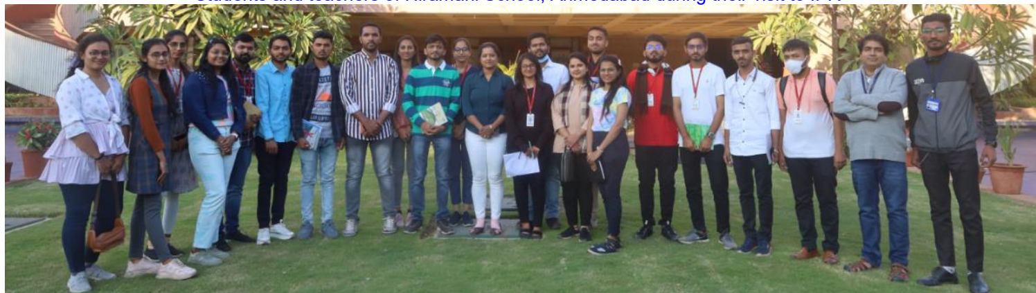
Students and teachers of Noble Group Institutions, Junagadh, Gujarat during their visit to IPR