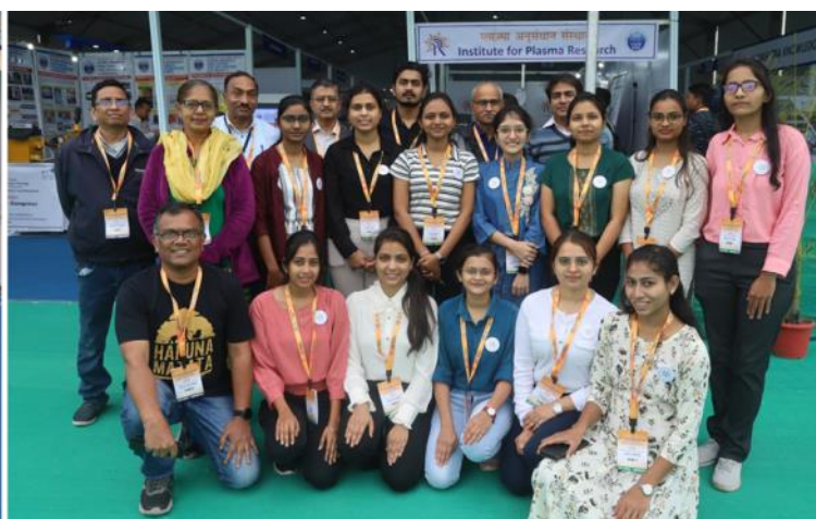
(L) IPR Team (R) Volunteers of the IPR stall with Outreach team in front of the IPR stall at the 108th ISC