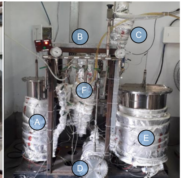
(L) MHD experimental loop at IPR (R) Indigenously developed Pb-Li production system (A) Li tank (B) Mixing vessel (C) Pb measuring vessel (D) Drain tank (E) Pb tank (F) Li nozzle