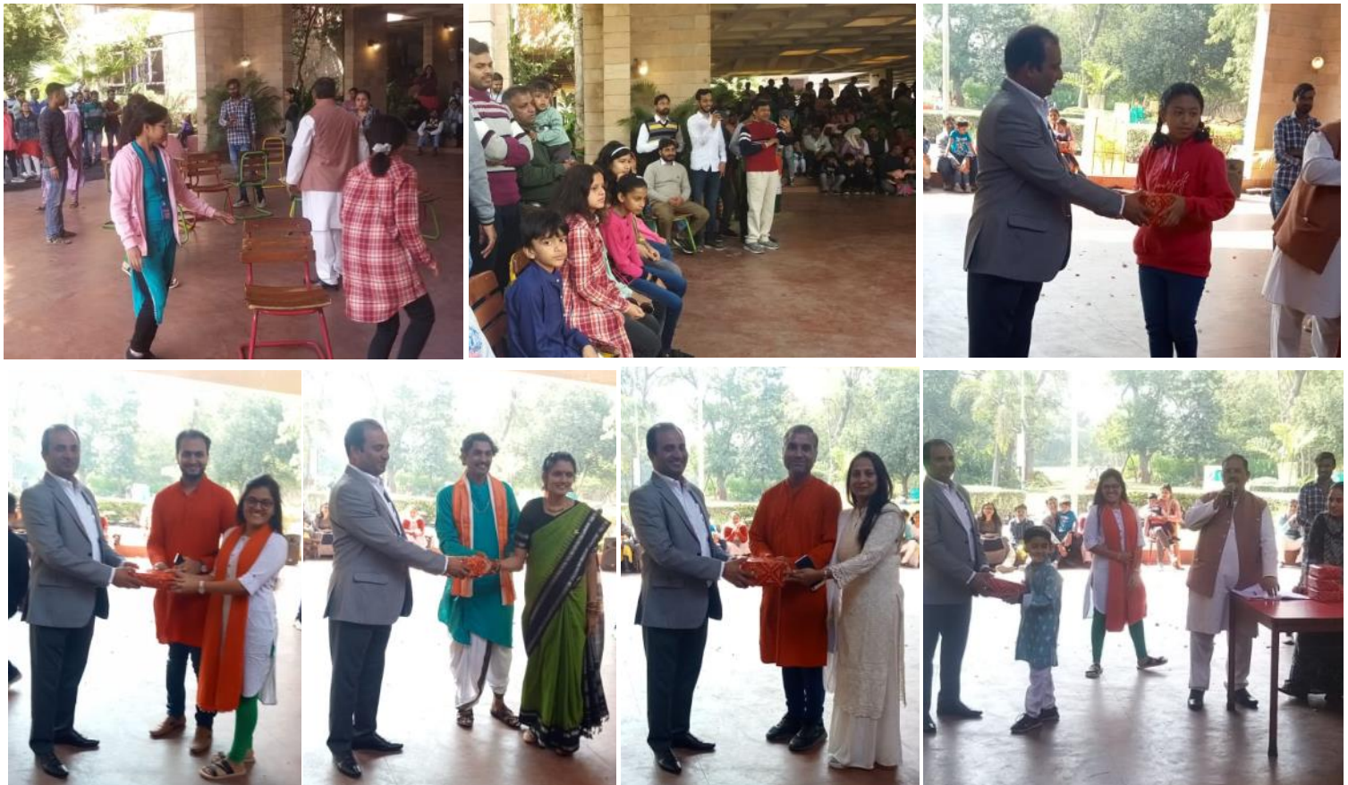
Images from the Republic Day celebrations held at IPR main campus