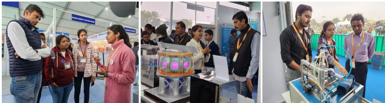
Images from the IPR stall at the "Pride of India" exhibition of the 108th Indian Science Congress