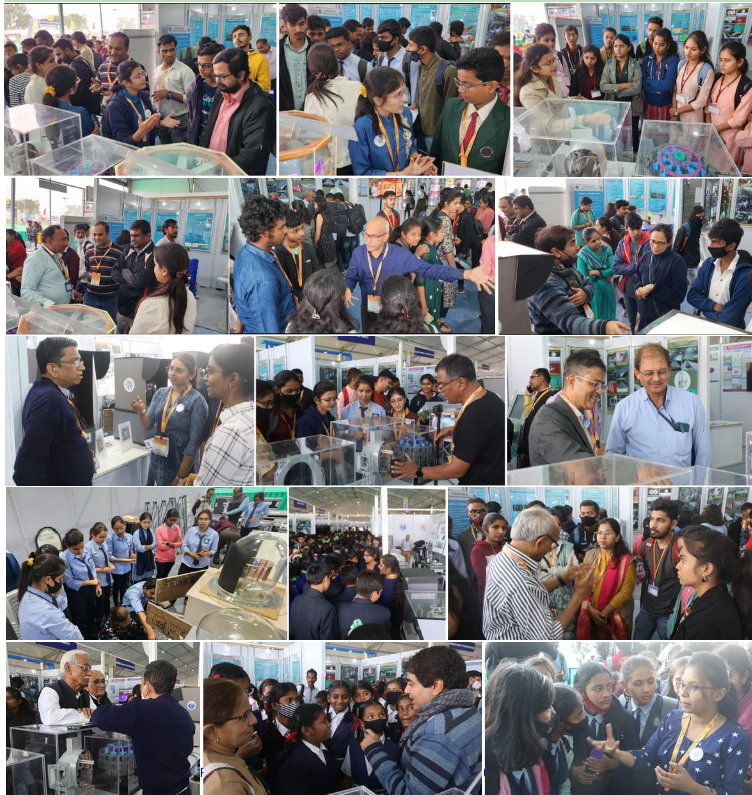
Images from the IPR stall at the "Pride of India" exhibition of the 108th Indian Science Congress