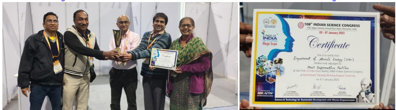
IPR team with the "Most Informative Pavilion" award which was awarded to the DAE pavilion.