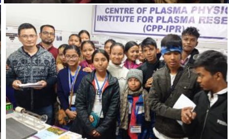
Images from the CPP-IPR participation in the Assam State Science Fair -2022