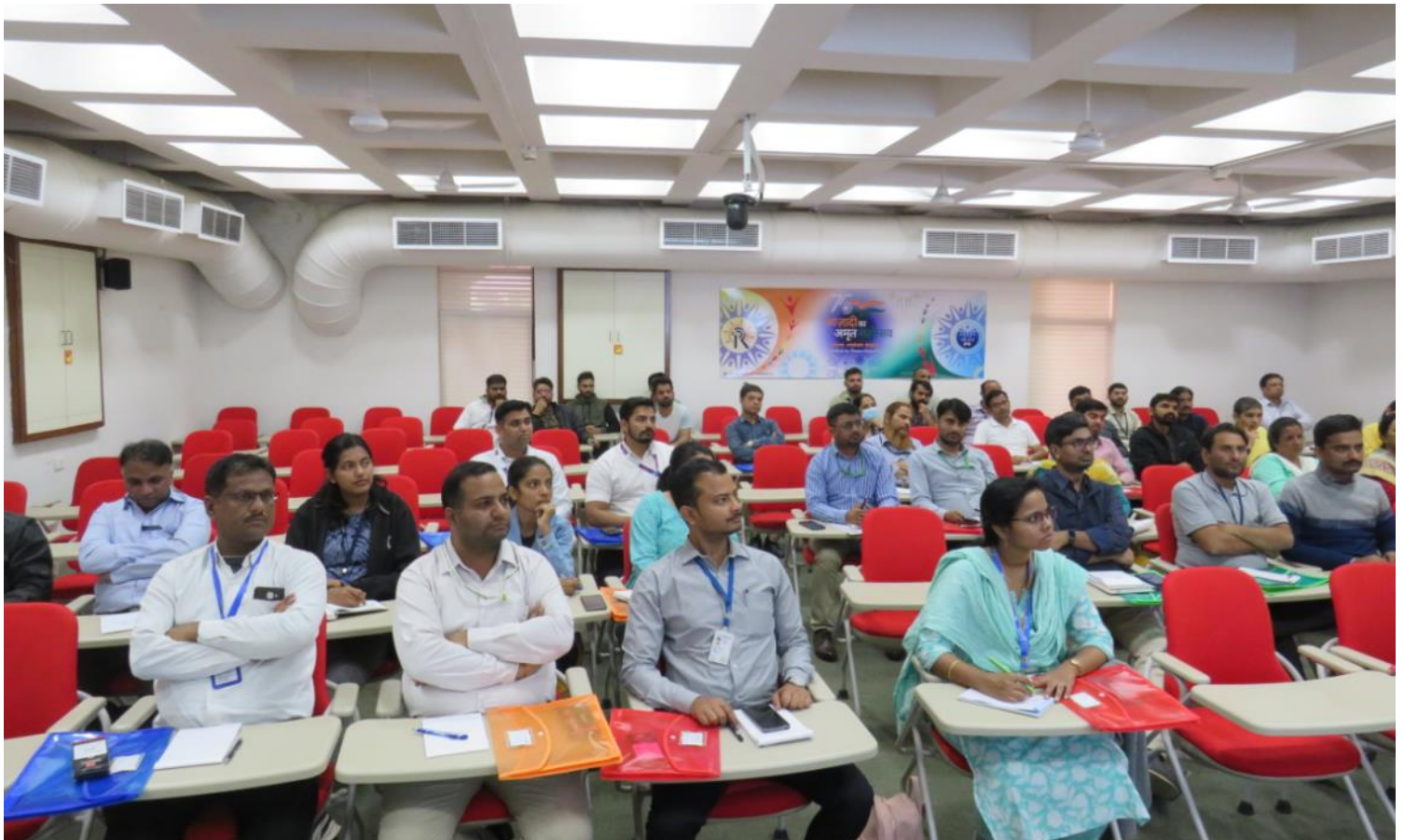
कार्यशाला के प्रतिभागी