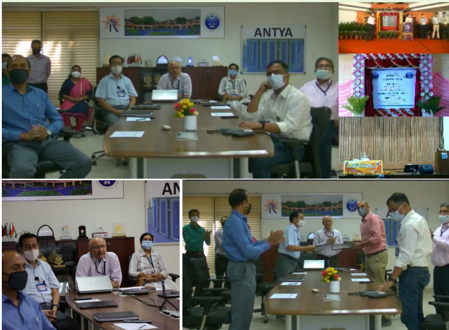
Images from the virtual inauguration of IPR Incubation center (Images from IPR Newsletter No. Issue 089, Dec 2020)