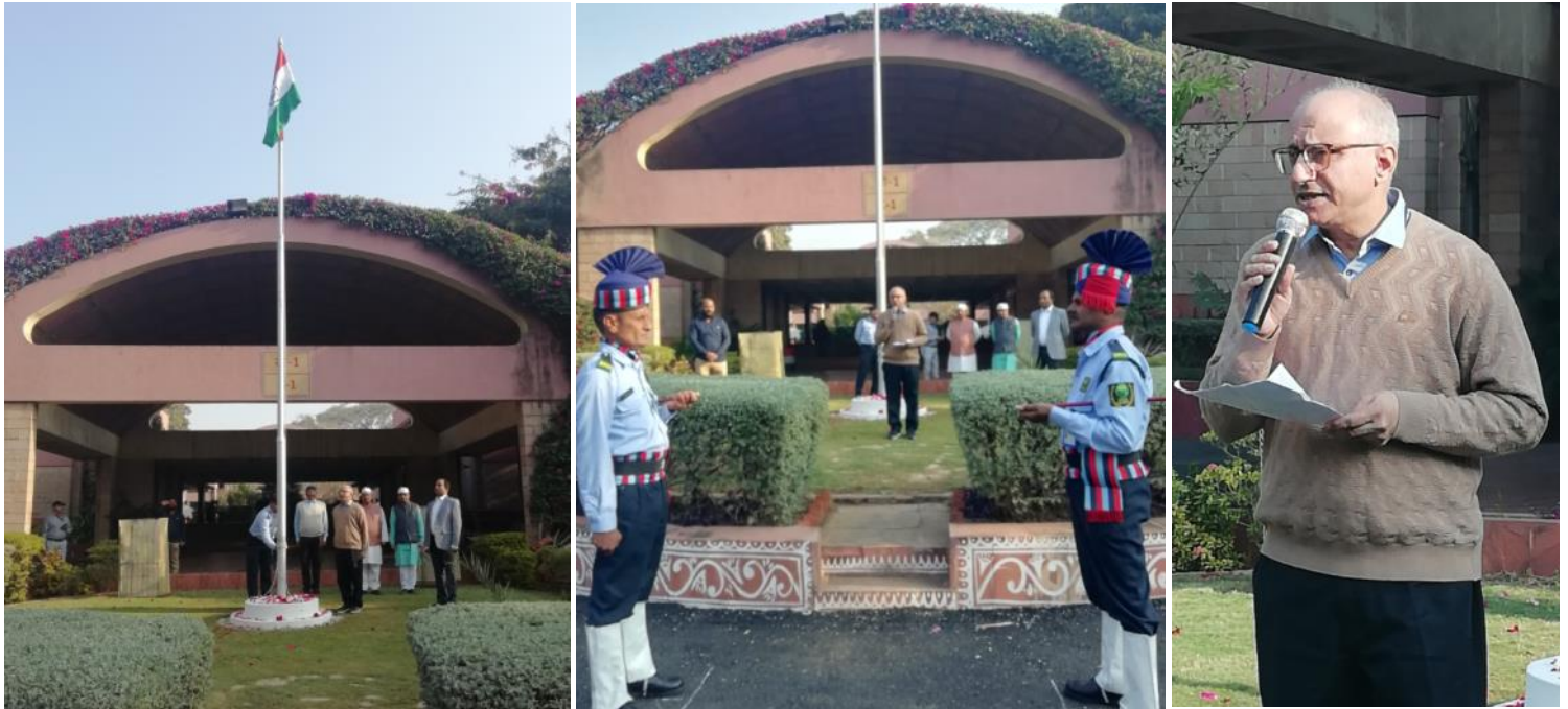
Unfurling of the tricolor and Director IPR addressing the gathering.