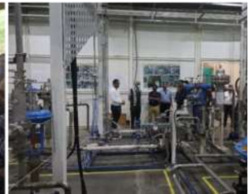
(L& M) In the EHCL control room (R) at the EHCL facility