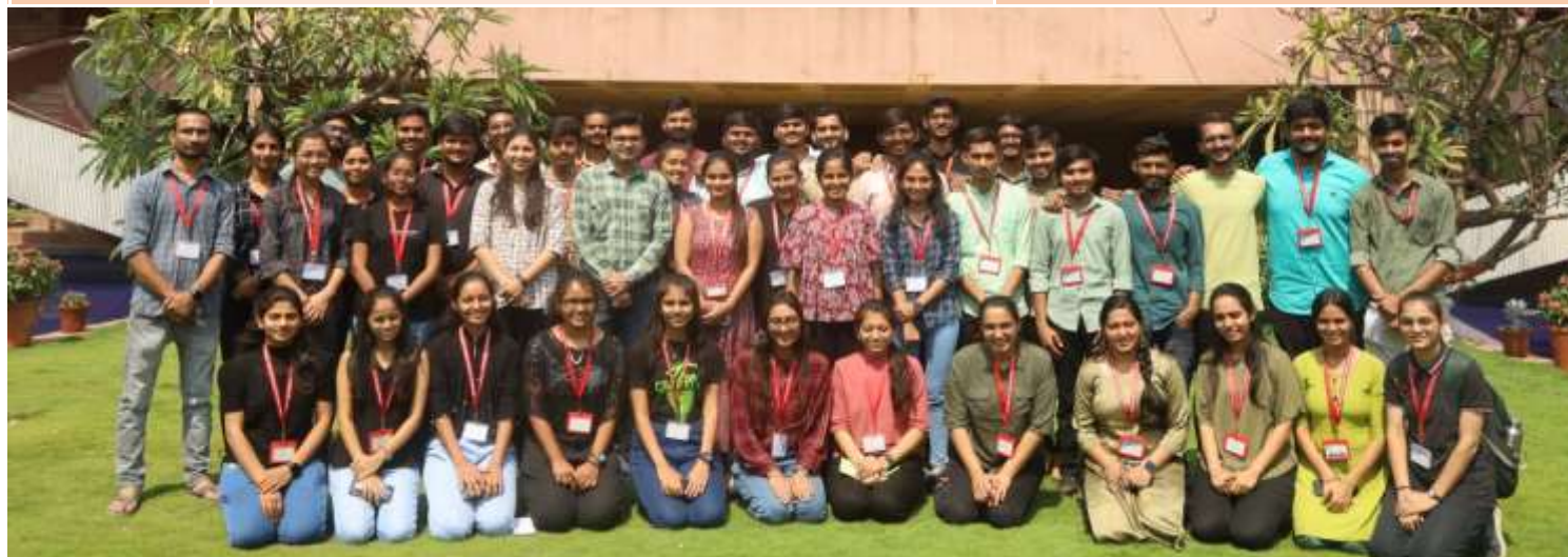
Students and faculty from Indian Institute for Teachers Education (IITE), Gandhinagar during their visit to IPR