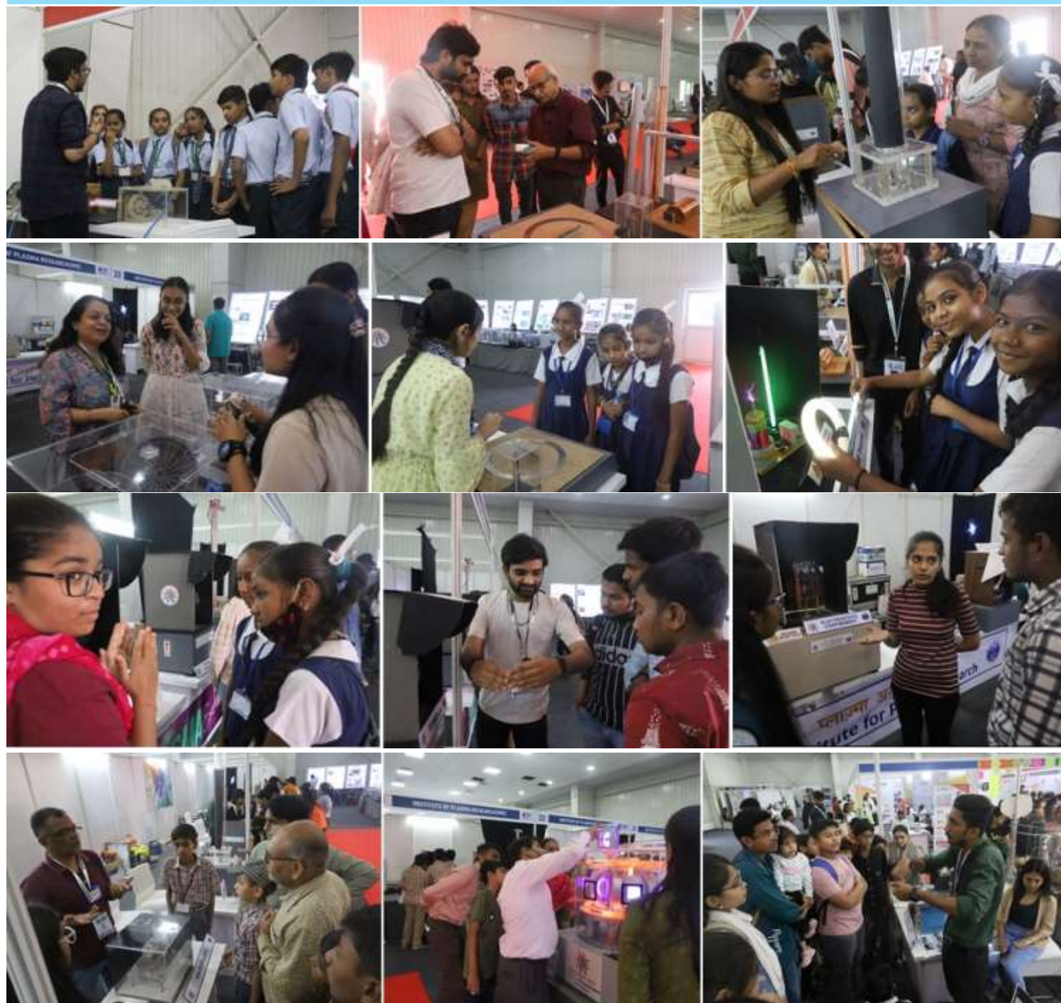
Images from the Science Carnival 2023