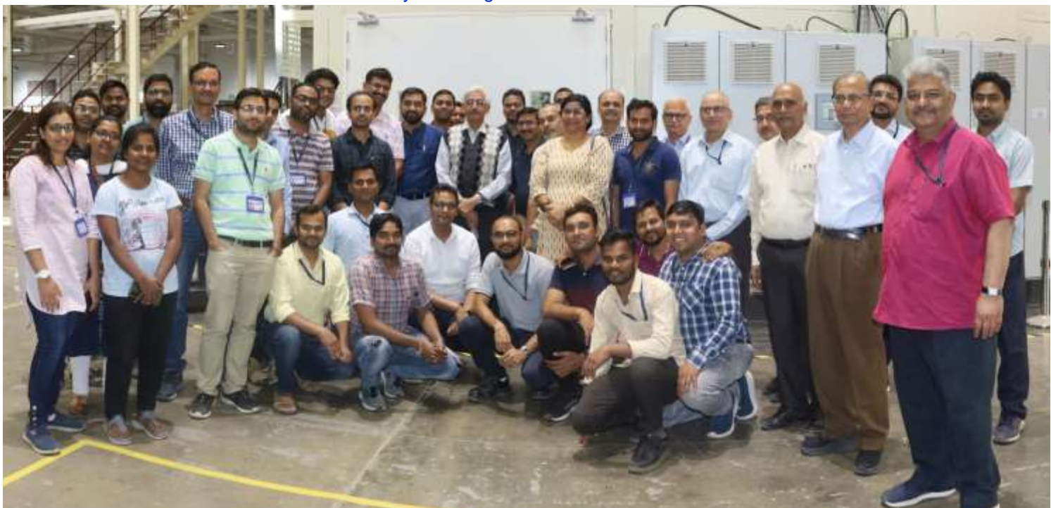
During the visit to EHCL and HHFTF facilities