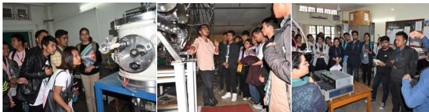
Students visiting various labs in CPP-IPR