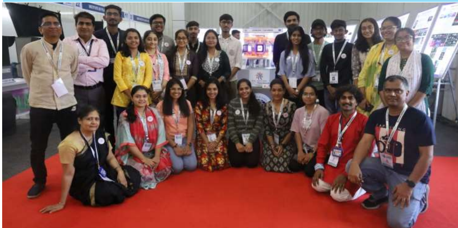
IPR Team along with the student volunteers of the IPR exhibition at the Science Carnival-2023