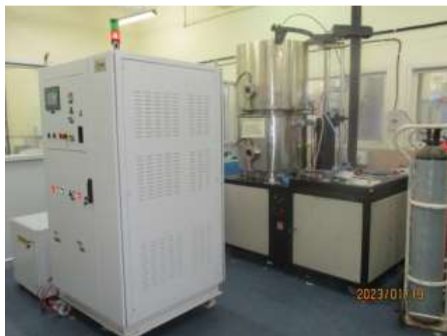
(L) The specifications of the Pulsed HV DC power supply (R) High voltage power supply integrated with Plasma Nitriding System at IGCAR Kalpakkam