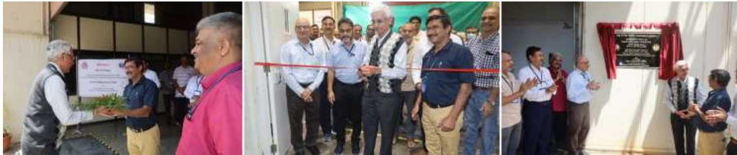
The Experimental Helium Cooling Loop (EHCL) lab being inaugurated

Helium is an attractive coolant for fusion power plant applications. An Experimental Helium Cooling Loop (EHCL) facility has been successfully installed and commissioned at IPR. It is a scaled down system of First Wall Helium Cooling System (FWHCS) of a fusion blanket module. The major components of this loop are: circulators, heater, recuperator, coolers, compressors and Test Section etc. Helium pressure and inventory in the loop is maintained by Pressure and Inventory System (PICS). This system will be integrated with the High Heat Flux Test Facility (HHFTF) to provide helium as a coolant during high heat flux testing.