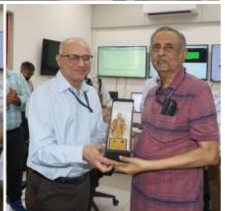
Facilitation of Chairman and other senior scientists who were involved in the development of the Neutronics Lab