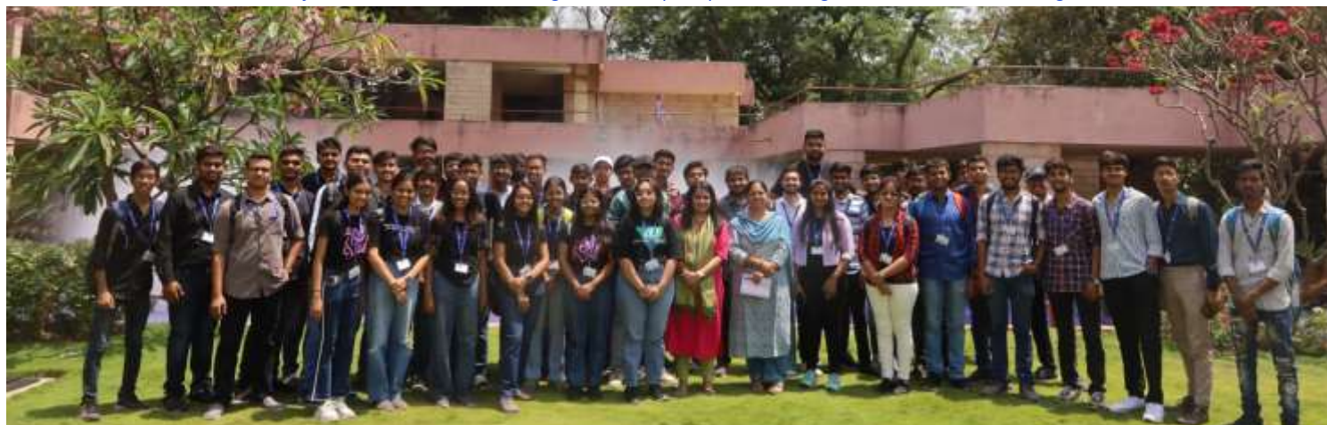
Students and faculty from Indus Institute of Technology & Engineering , Ahmedabad during their visit to IPR