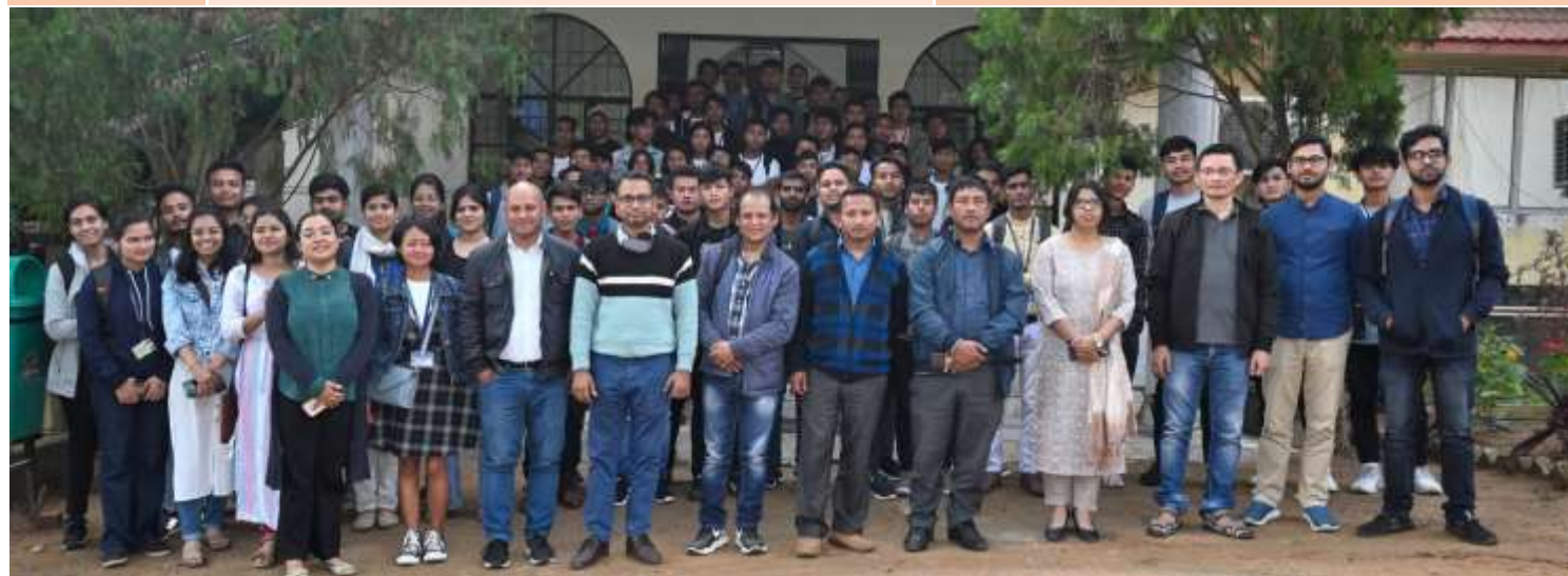
Students from Guwahati and Shillong during their visit to CPP-IPR