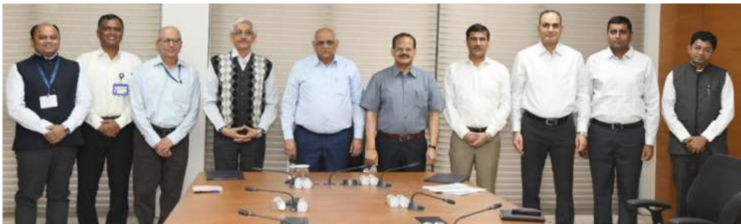
Images from the signing of the MoU