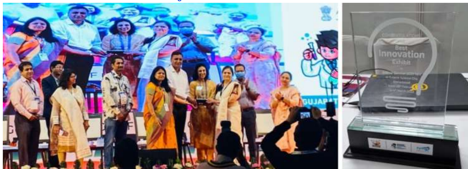
IPR receiving the "Best Innovation Exhibit" award at the Science Carnival 2023