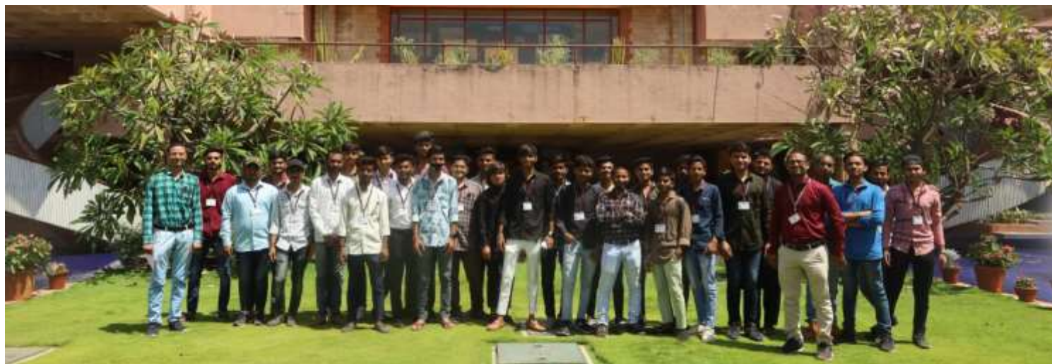
Students and faculty from Industrial Training Institute (I.T.I), Kubernagar, Ahmedabad during their visit to IPR