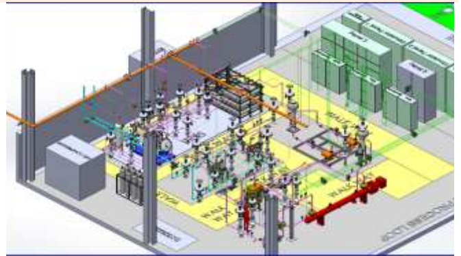
(L) The 14 MeV D-T neutron source and accelerator (R) Schematic of the EHCL facility