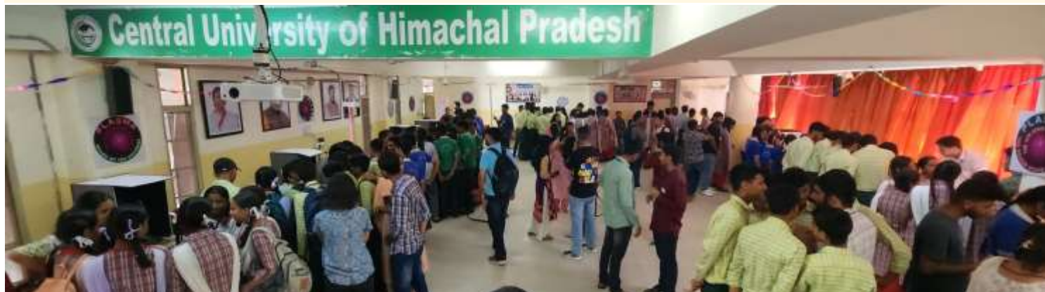
View of the exhibition of Plasma and its applications at CUHP, Himachal Pradesh