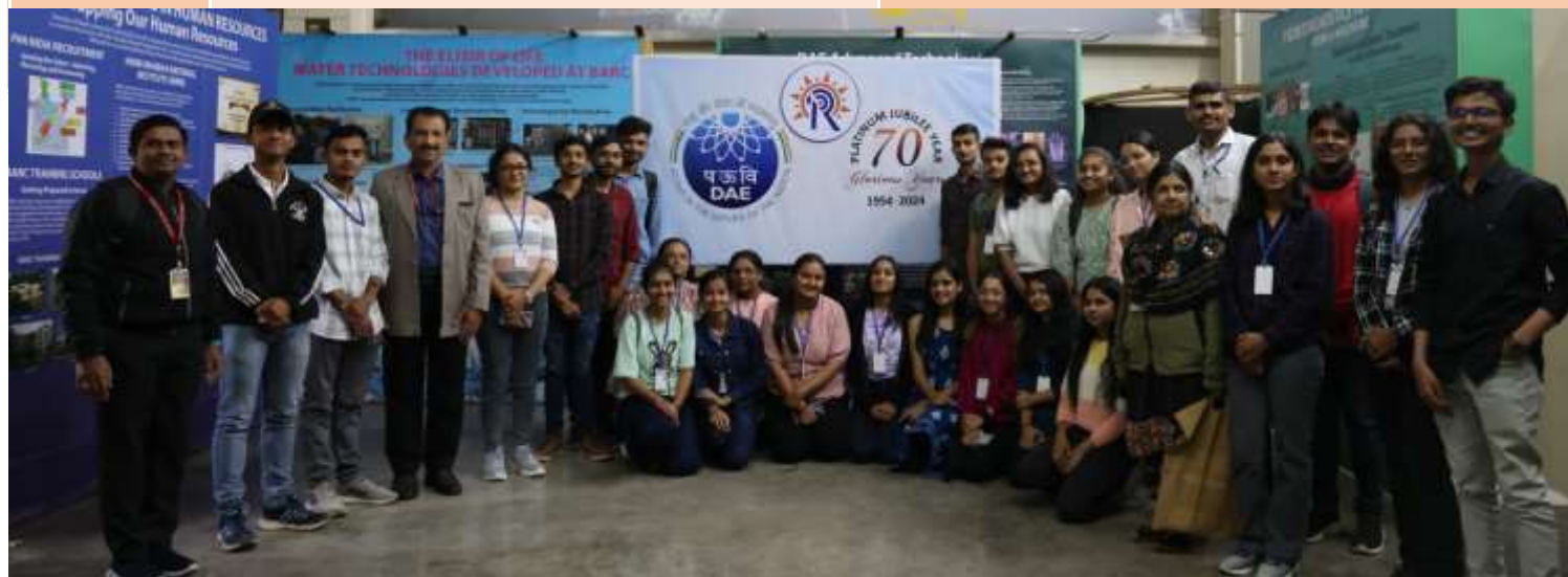
Students and teachers of Christ College, Rajkot, Surat, during their visit to IPR