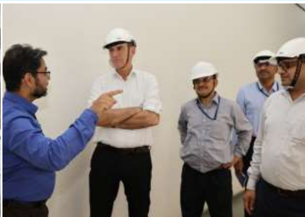
The Director General of ITER interacting with IPR staff