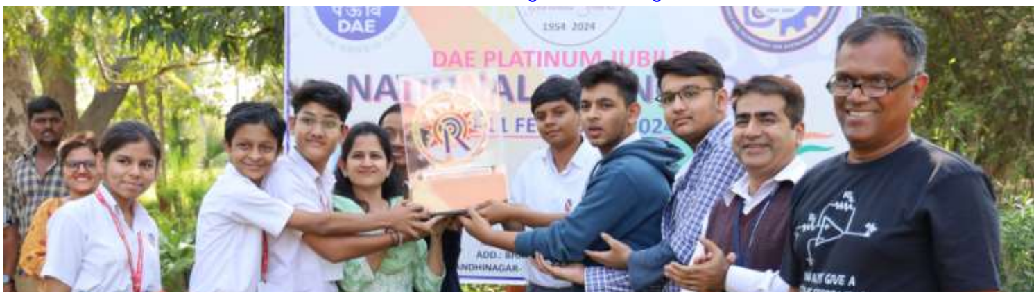
The IPR NSD Rolling Trophy for the year 2024 being awarded to St Xavier's High School, Gandhinagar