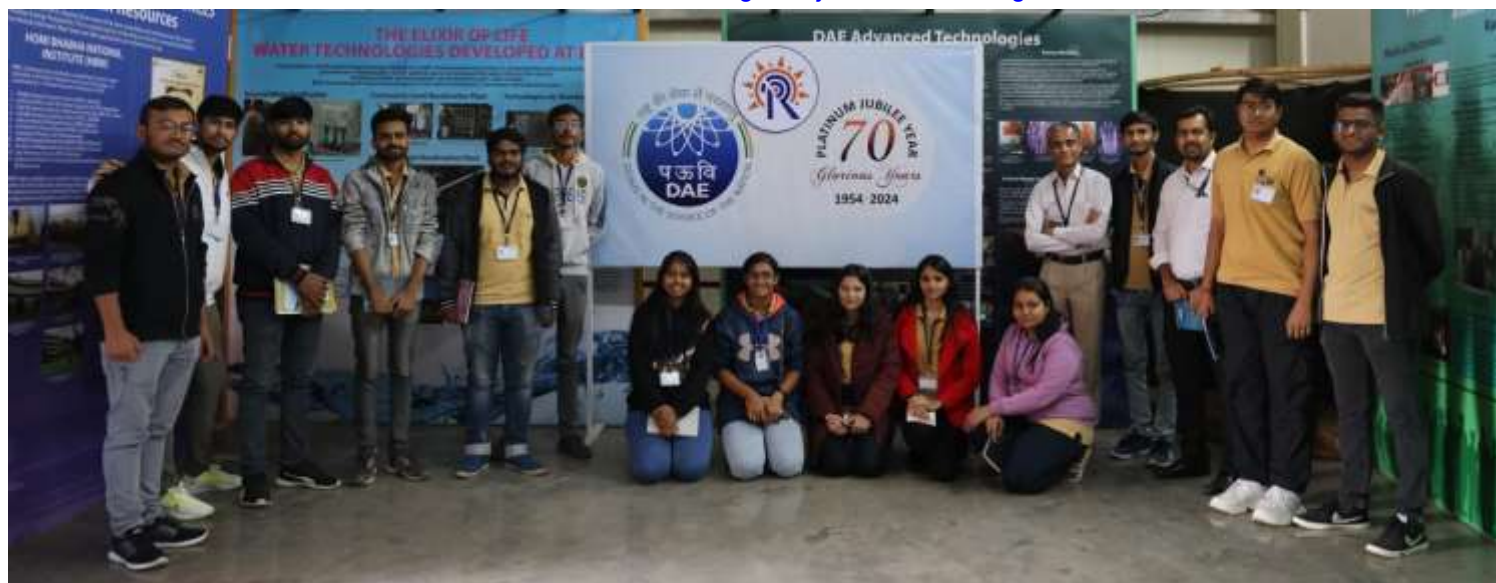
Students and teachers from Marwadi University, Rajkot, during their visit to IPR