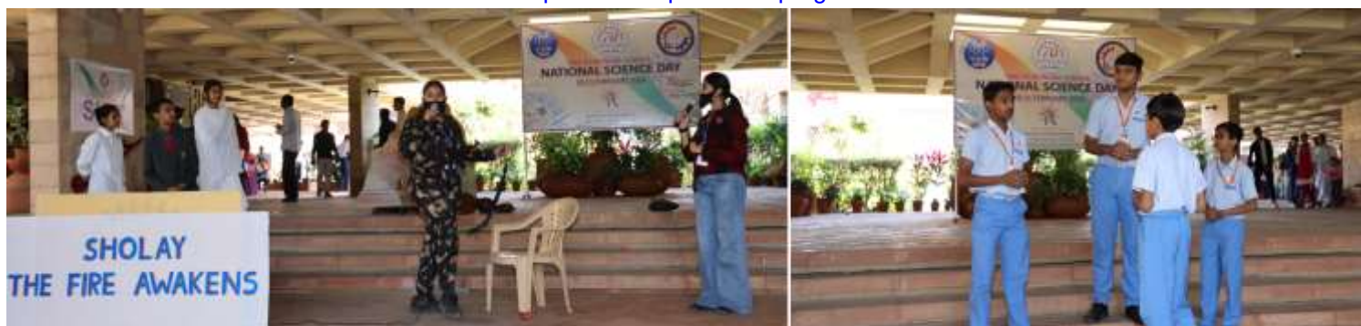
Skit competition in progress