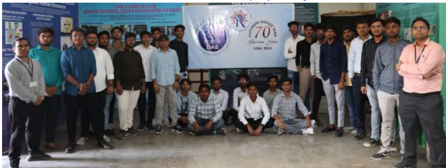
Students and teachers of K. D. Polytechnic, Patan, during their visit to IPR