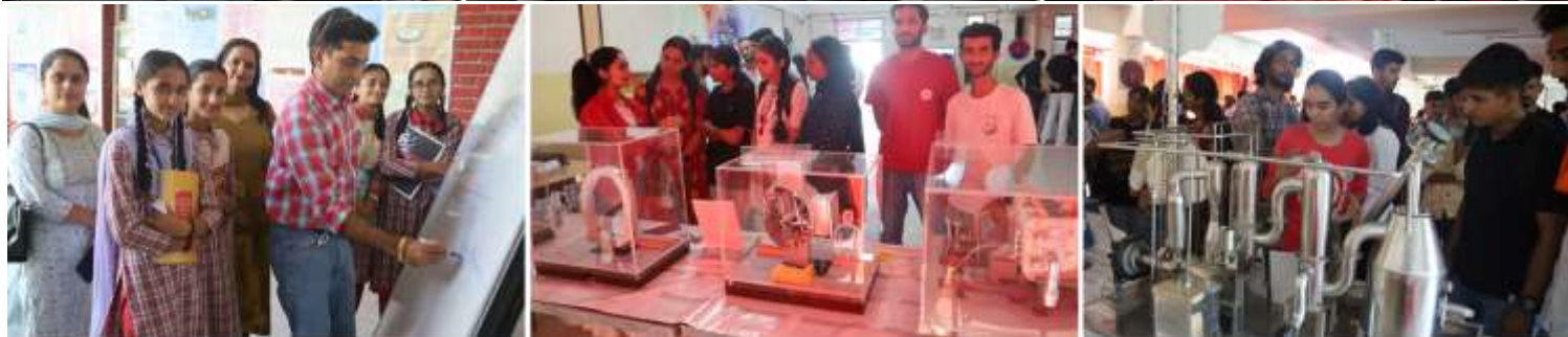
Volunteers from CUHP explaining the plasma exhibits to visitors