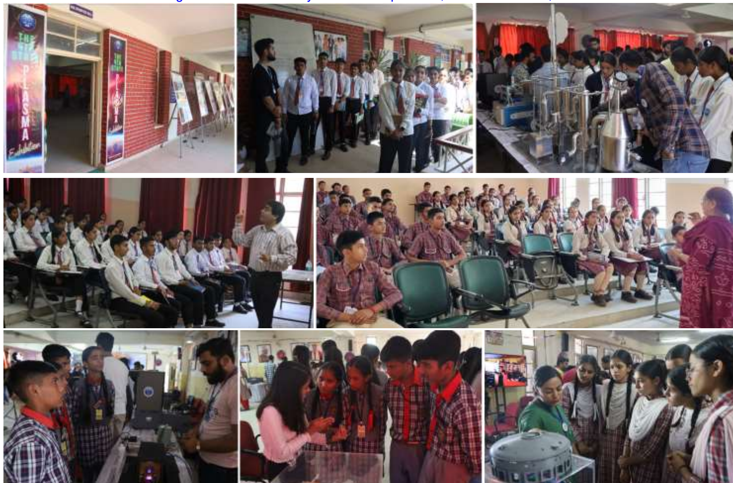
Images from the plasma exhibition held at CUHP, Shahpur, Himachal Pradesh