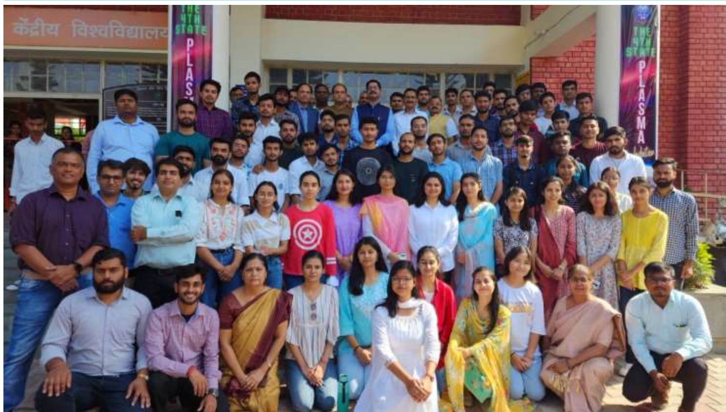
IPR team with the volunteers from CUHP, Himachal Pradesh, during the Plasma exhibition held at Shahpur (HP)