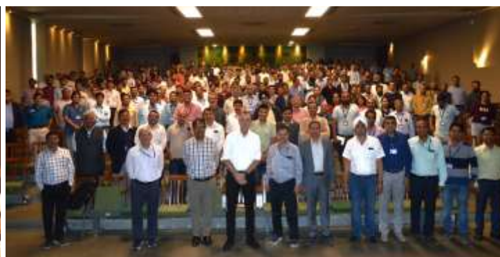
The Director General of ITER delivering his talk

The DG also took the occasion to visit the ITER India laboratories (viz., ITER-India Gyrotron Test Facility (IIGTF), ICRH Lab, Indian Test Facility INTF- Diagnostic Neutral beam, Power Supply Lab, ITER-India Cryogenics Laboratory, Diagnostic Lab), High heat flux test facility, Experimental He cooling system lab, ROBIN lab, the RH and virtual reality lab, ADITYA and SST-1 and took keen interest in various developments. In the evening, the DG had an interaction session with the ITER-India colleagues.