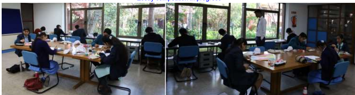
Poster competition in progress