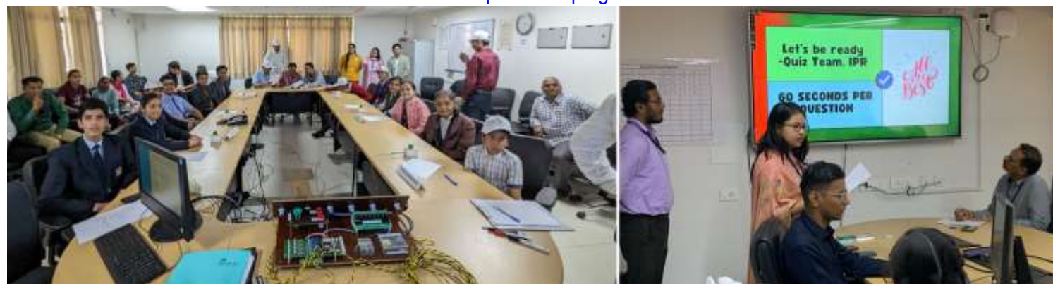
Quiz competition in progress