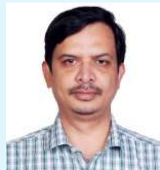
Prof. M. Krishnamurthy

Abstract: Intense ultrashort pulse lasers generate relativistic electrons when the intensity reaches relativistic scales, 10^{18} Wcm -2 for 800nm pulses. This requires Terra watt class lasers that are complex, cumbersome, expensive and deliver typically 10 pulses per second. While the electron/x-rays/proton beams generated from such system have shown a lot of promise, developing applications on such systems is very challenging. I will talk about experiments where even at a 1/100th of laser intensity, it is feasible to generate relativistic electron beam of 1 MeV energy with multi kHz few mJ/pulse lasers. We show that plasma wave instabilities generated and manipulated with suitable target is the underlying mechanism. The source size of the short pulse electron beam is amenable for x-ray radiography and shadowgraphy.