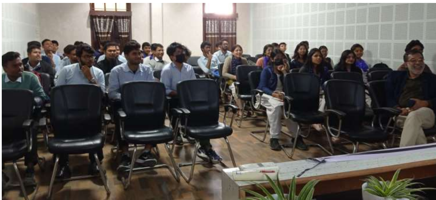
Photos from the one-day plasma event held at Arya Vidyapeeth College, Guwahati