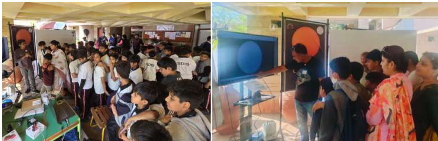
Solar observation event