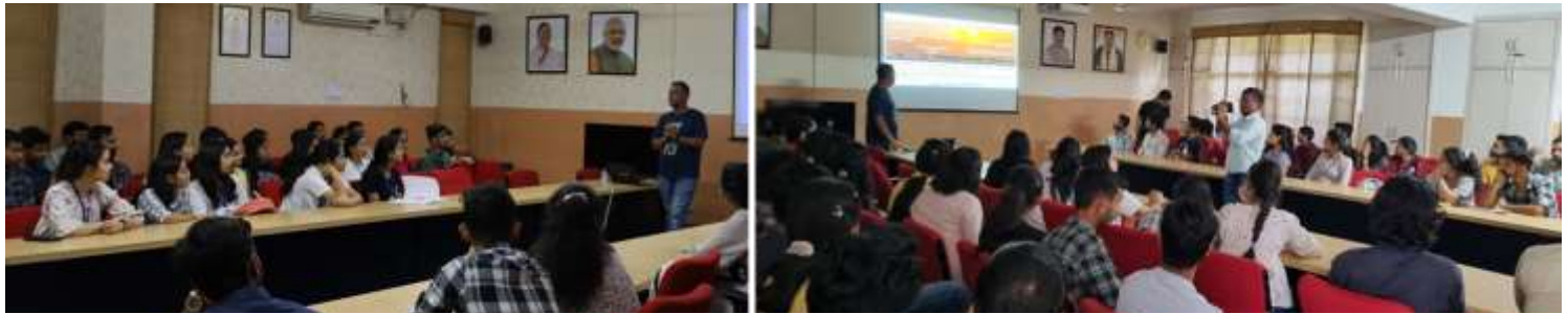
Training the student volunteers from CUHP for the exhibition