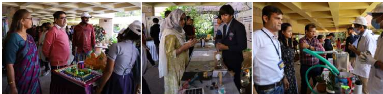
Science models by school students