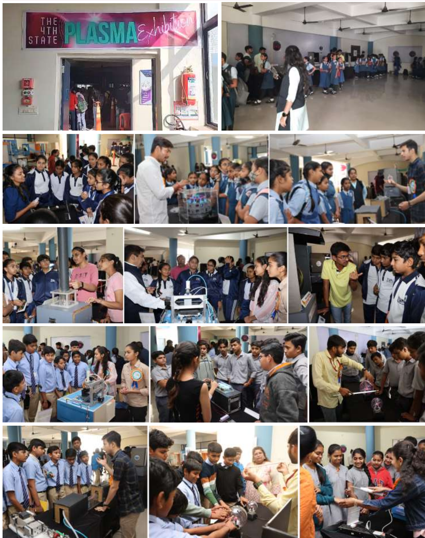
Images from the Plasma exhibition held at the Shri Balvant Parekh Science City, Bhavnagar