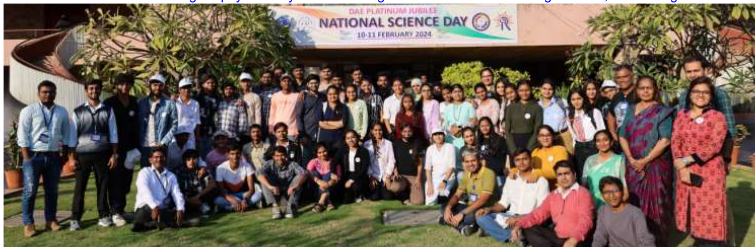
Volunteers from MG Science College, Ahmedabad with IPR NSD Team