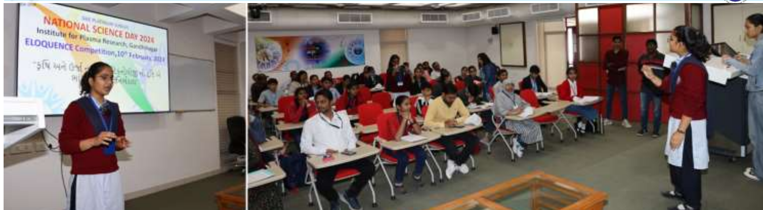
Eloquence competition in progress