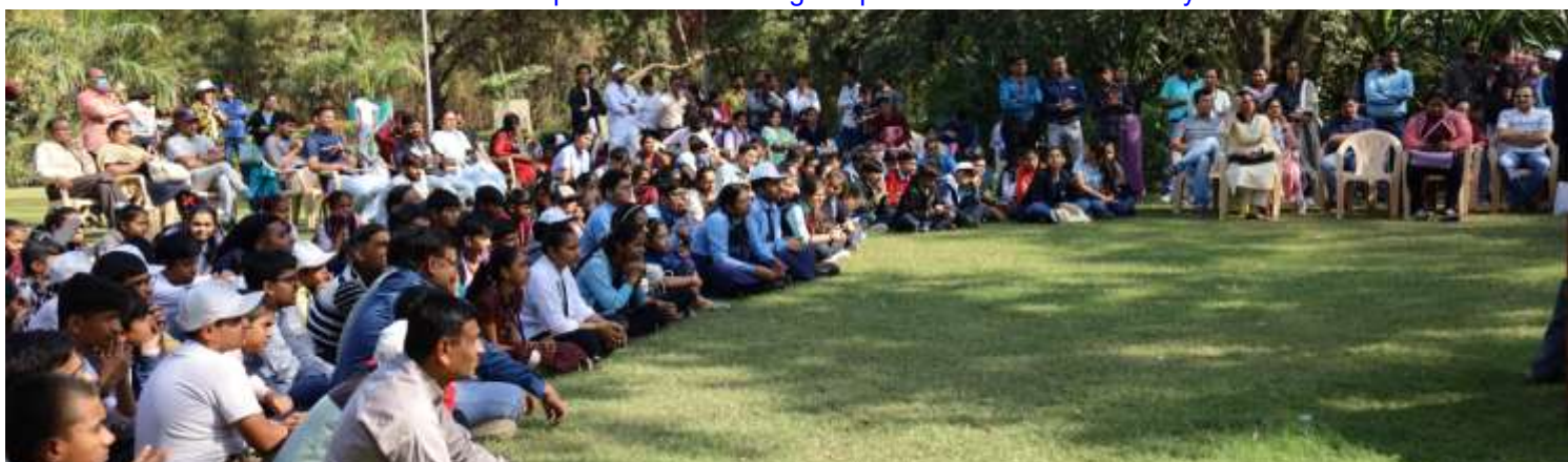
View of the audience during the concluding session