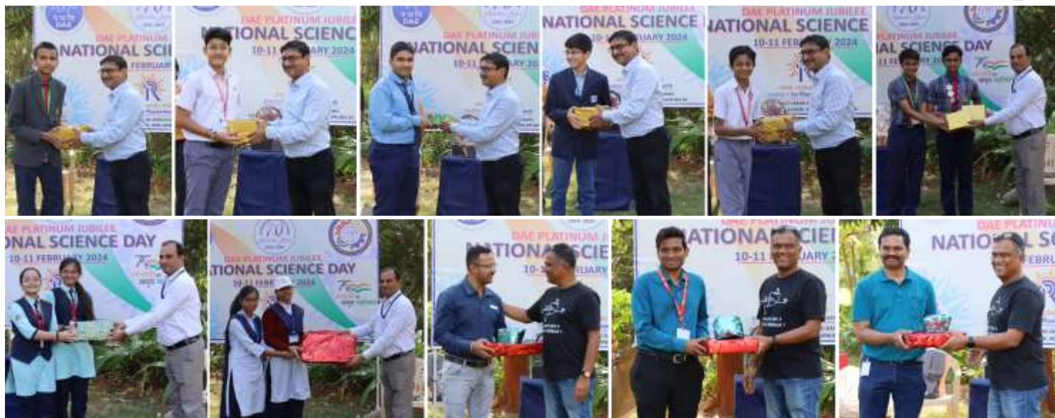
Some of the prize winners during the prize distribution ceremony