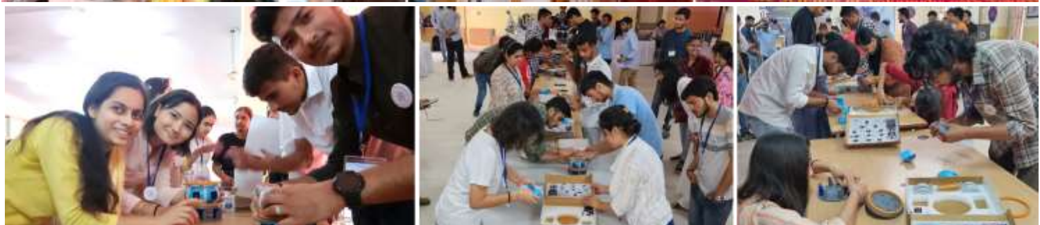
Student volunteers explaining the plasma exhibits to visitors